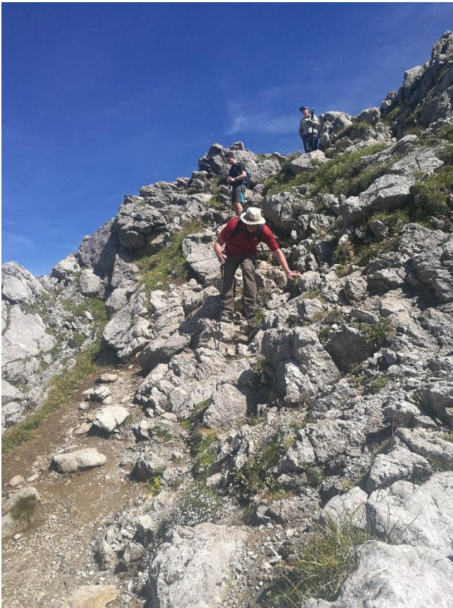
Probably the trickiest part of the entire hike, and it's not really that tricky for anyone with any mountain hiking experience at all. You're not exposed and there's really no danger if you watch your step (as you always should).