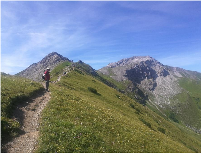
A view of the ridge hike from the cablecar summit station. Augstenberg is in the background to the right, and you get there in approx. 90 minutes.