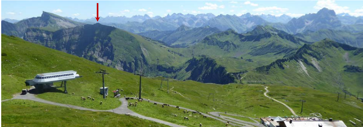
View to the East from Diedamskopf summit. The arrow shows the second summit Hählekopf. It takes some time to get there.