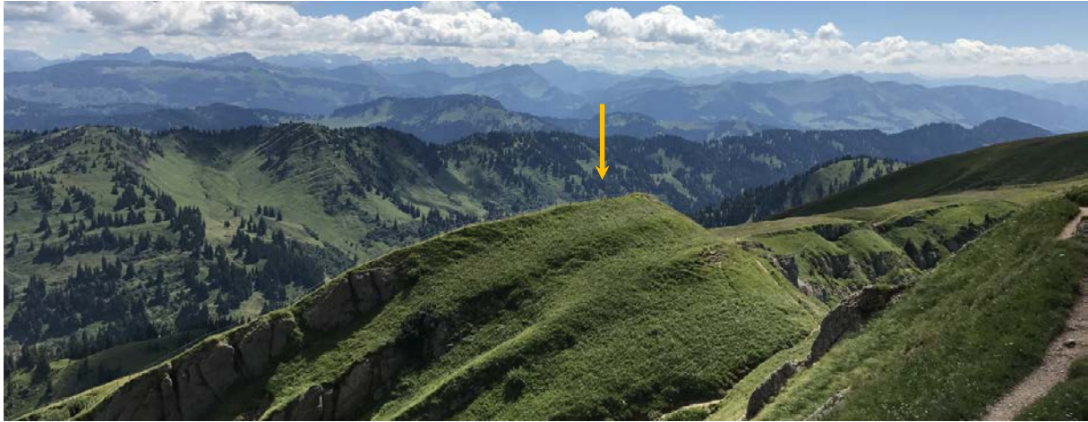
Beautiful molasse landscape seen from Rindalphorn summit. The arrow shows the position of the operator behind the fence.

Facts & figures (distances and time are always "one-way", measured in the mentioned direction):