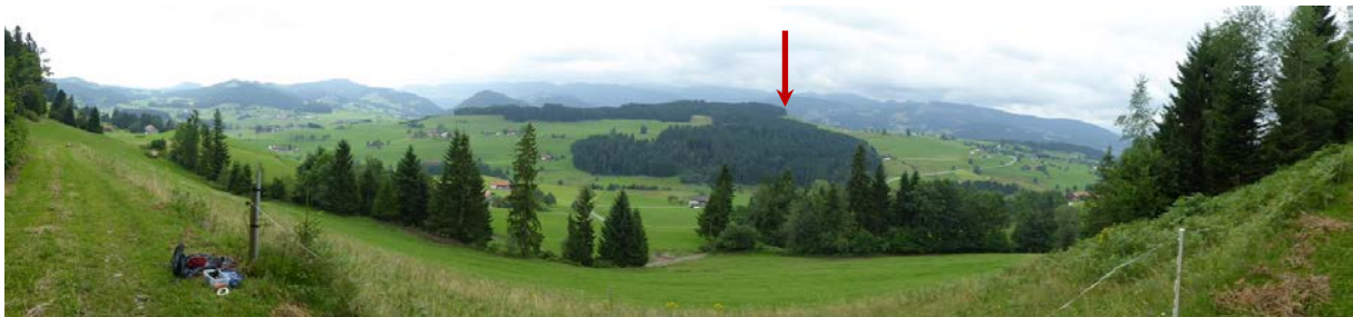
A panorama picture taken from Gehäuenholz. The red arrow marks the former position at Attensberg, only some kilometers to the Southeast. SOTA offers nice views from places you would probably never visit without SOTA!

We had picked up Salmaser Höhe, DL/AL-142, just east of Oberstaufen, as our starter. We had seen a toll road on the map and a parking lot at its end. Unfortunately, this road was marked “forbidden for cars and motorcycles” and “forestry and agricultural traffic allowed” directly after the railway crossing, so we returned and drove to Oberstaufen to check out Stauf, DL/AL-144, a hill with a communications tower just east of the center. But we skipped this one, too, because of the uncertain weather at that time – getting wet was not to our taste.