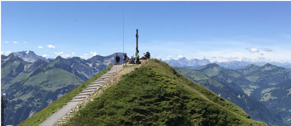
Diedamskopf summit including a renewed summit cross, the operator and his antenna.

Diedamskopf was the first summit where I did the minimal number of QSOs on 2m FM already, since I had made an appointment to call there some local SOTA friends. Some further QSOs with the big antenna followed for the audience.