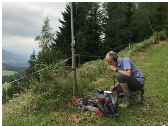
Struggling with the wind on Attensberg summit (left) and weakening knees on Gehäuenholz summit (right).

A second one-pointer, Gehäuenholz, can be seen northwestwards from Attensberg. We continued on B308 road to get there and parked at the hamlet of Vorderreute, near a chapel. A farmer asked us for the purpose of our walk and it seemed that he already has met there SOTA operators earlier. We