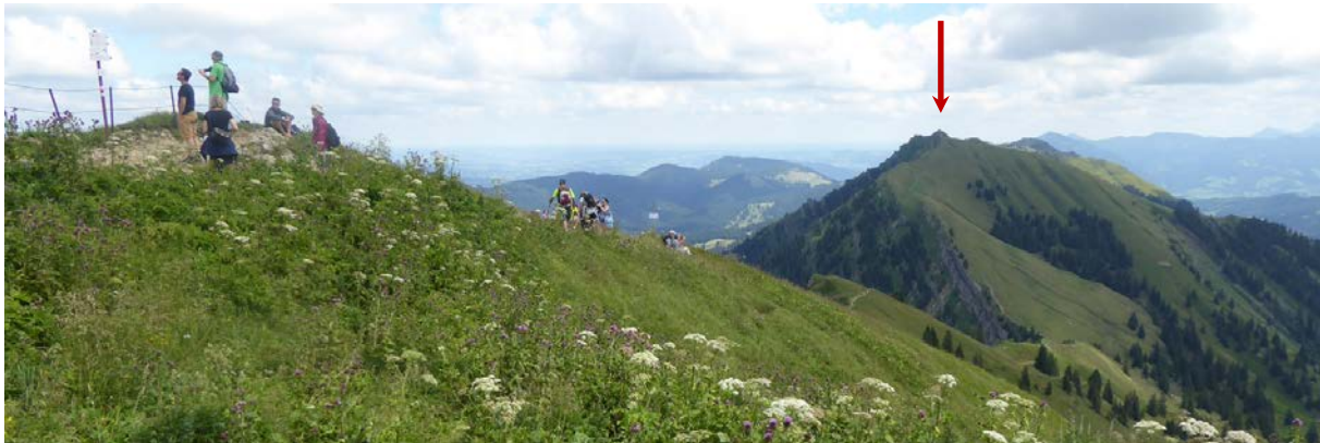
View to the East from Hochgrat to Rindalphorn, our next summit.

The summit is located at 1832 m.a.s.l., with an ascent of 125 m from the lift. There are two paths to the summit, one quite rocky on the ridge and a gentler newer one. The summit is quite crowded, so we set up the equipment some meters apart, behind a fence that I could use as a mast support.