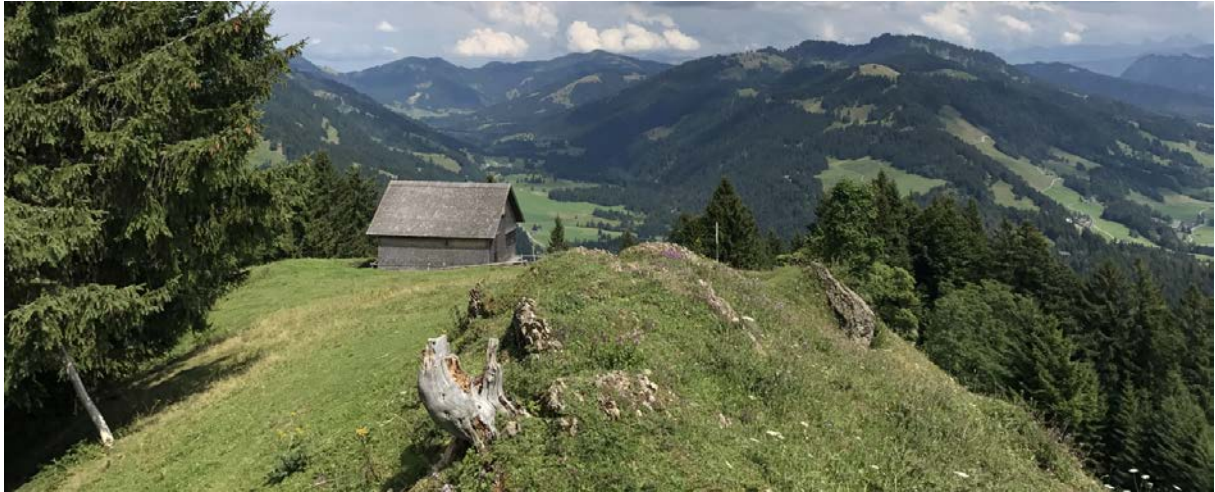
Probably the most peaceful place on the ridge of Hittisberg: an alpine hut and beautiful meadows.