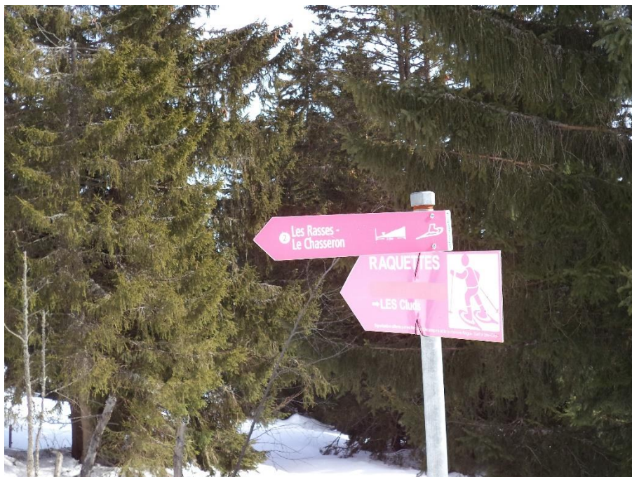
Sign at Waypoint B instructing you to turn left and start climbing.

The many snowshoe trails in the area are well marked. For this trip, you follow Route #2 (see the map at the end of this report). Follow the paved road to Waypoint A and continue straight until Waypoint B, where you turn left. Until now the trail is relatively flat, but now you make a steady ascent the entire way up. The total ascent is 372 meters, the trail is 3.2 km long, and it took us 1 hour 25 minutes to get to the summit. The entire way we could enjoy very well maintained snowshoe trails.