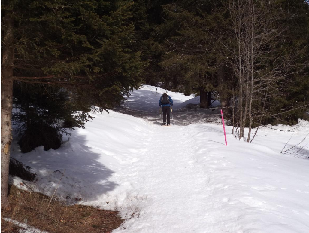
The first two-thirds of the hike takes you through a forested area.