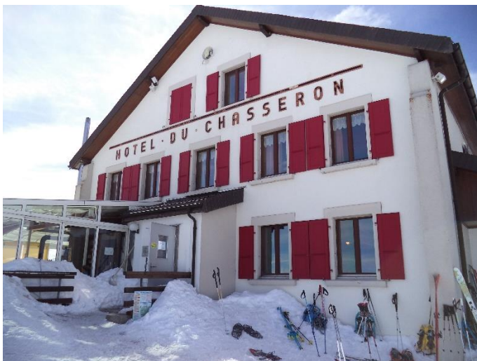
The hotel/restaurant at the summit, also open in winter and a very popular place to stop for a drink or a bite to eat. Closed on Mondays and Tuesdays.

After the activation we stopped into the restaurant for something to drink, and then we made our way back down to the parking lot. (Note: the restaurant is closed on Mondays and Tuesdays.)