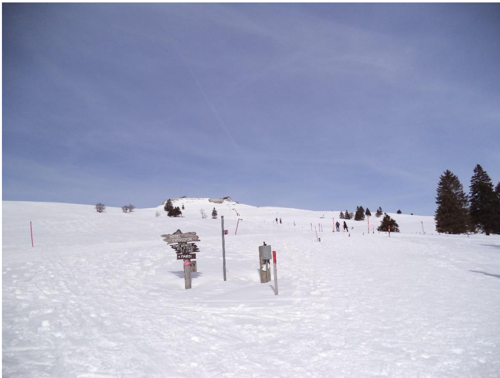
At Waypoint C, when you exit the forest, you can see the hotel and the summit straight ahead.