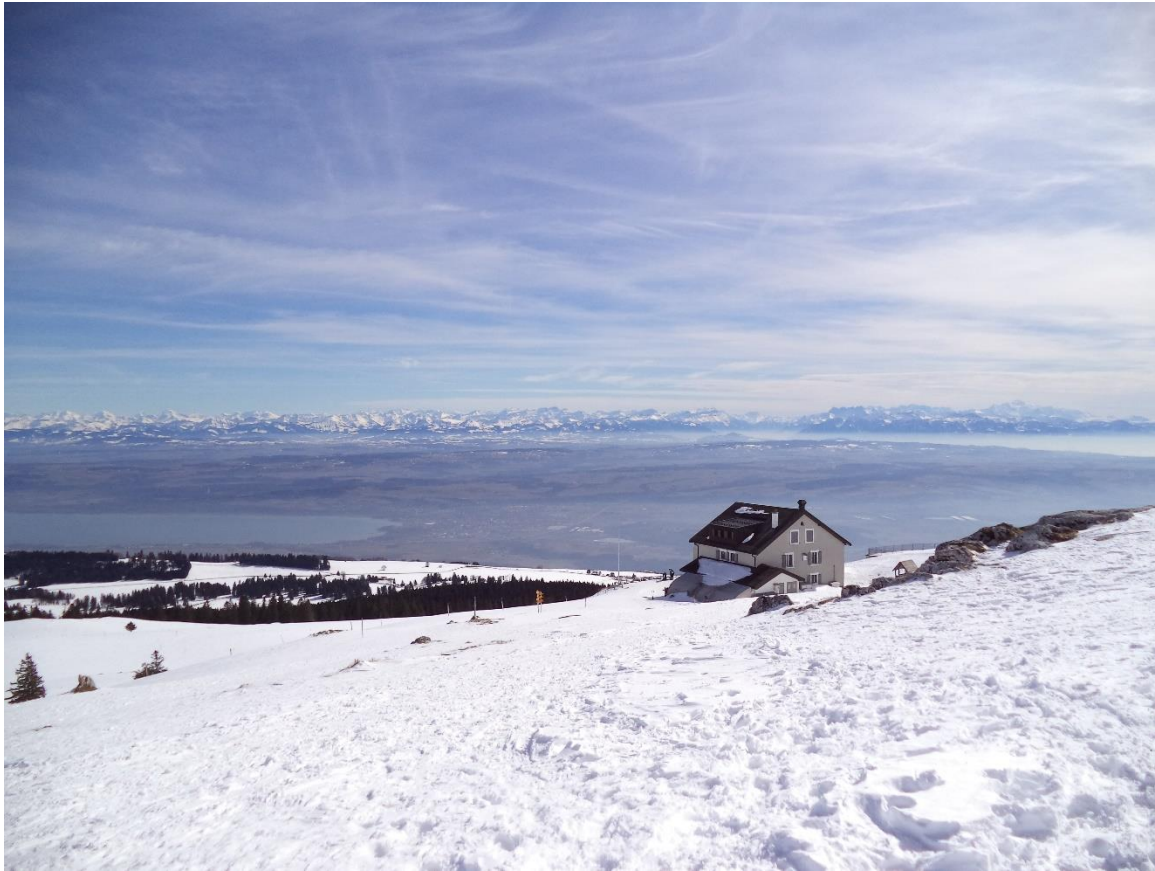
The view from the summit, looking down upon Lake Neuchatel (left) and Lake Geneva (right) with the Bernese Alps in the background left and Mount Blanc, Europe's highest peak, on the right.

After the activation we stopped into the restaurant for something to drink, and then we made our way back down to the parking lot. (Note: the restaurant is closed on Mondays and Tuesdays.)