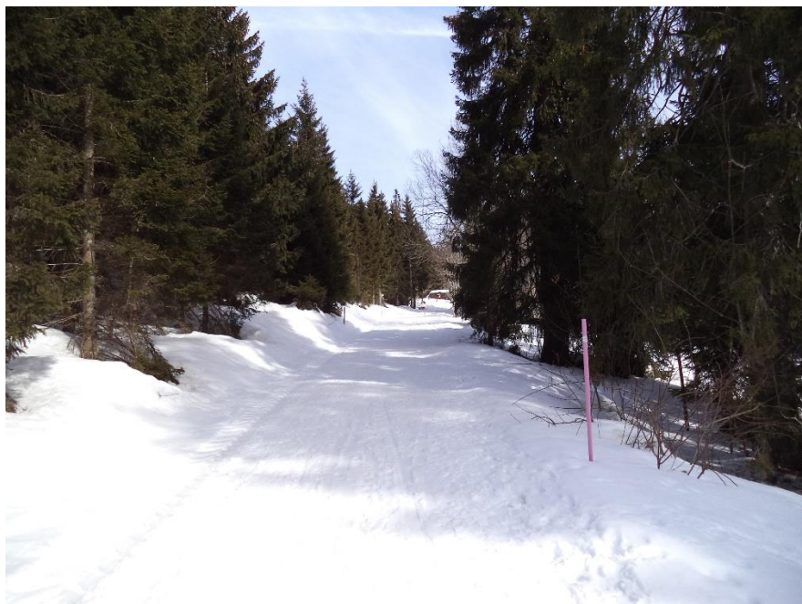
The stretch from Waypoint A to Waypoint B continues almost flat.