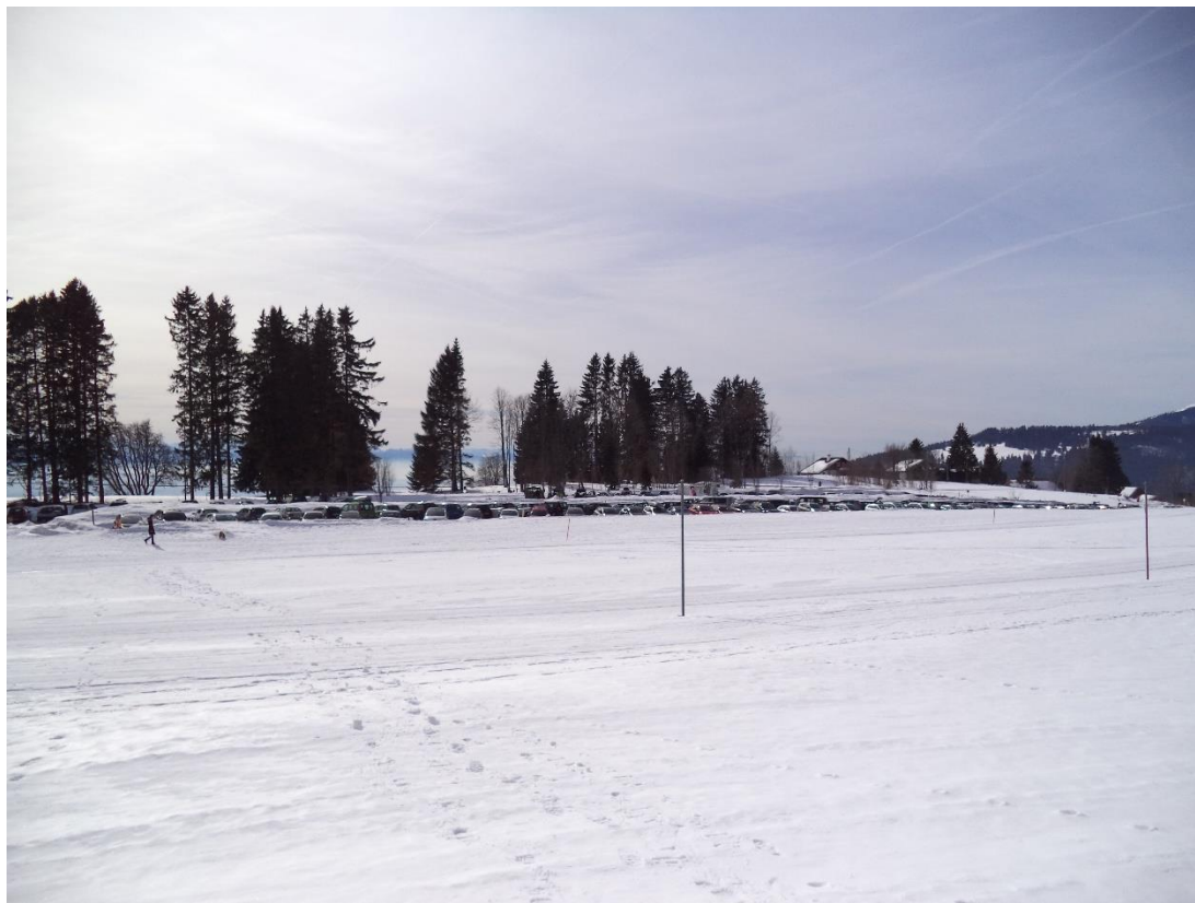
Large (free) parking lot at Las Rasses.