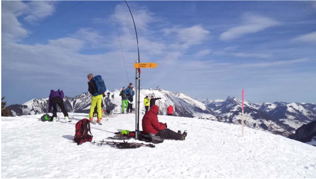
Operating position -- no benches or seats; lots of activity on this summit.