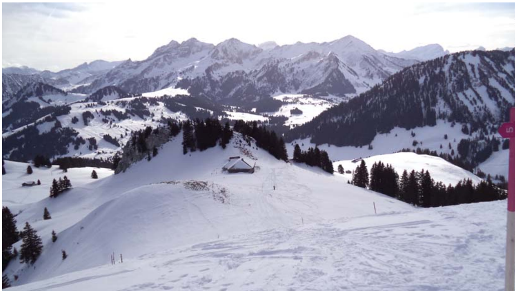
View of the trail up the summit from the top.