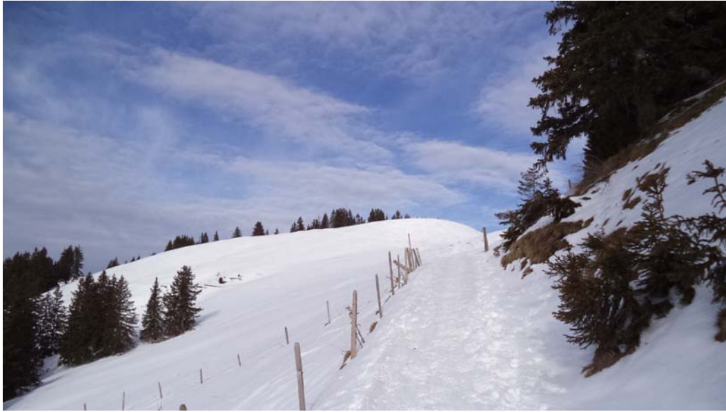
The last couple of hundred meters to the summit.