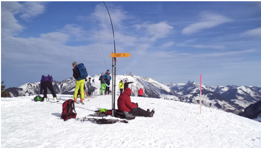
Operating position -- no benches or seats; lots of activity on this summit.