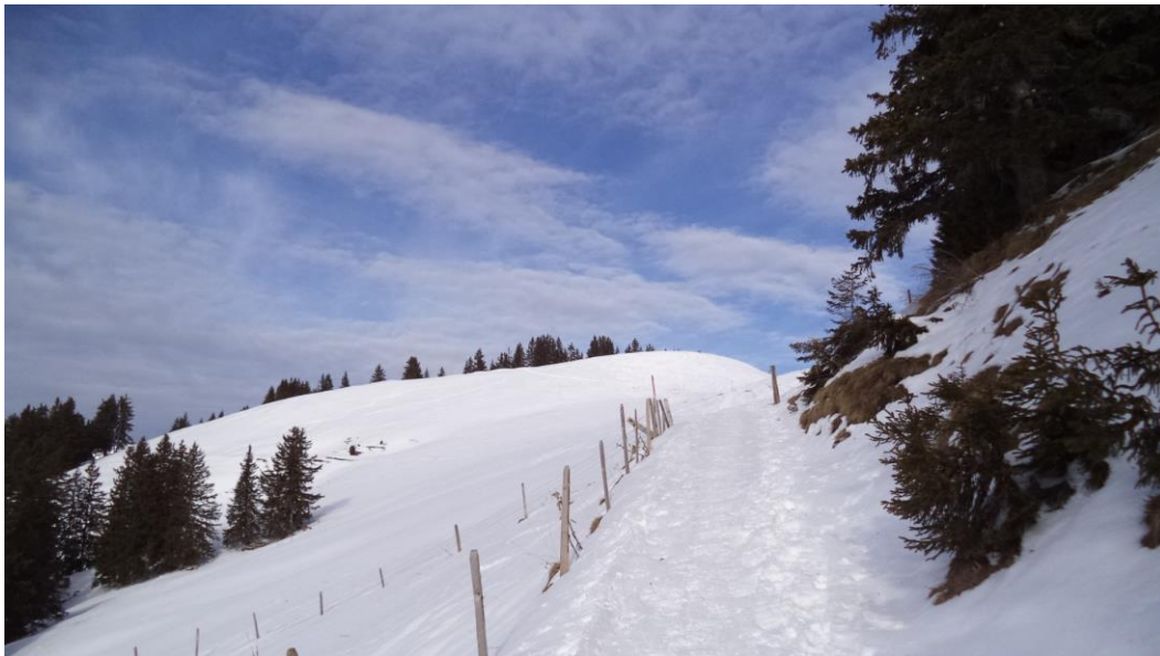
The last couple of hundred meters to the summit.