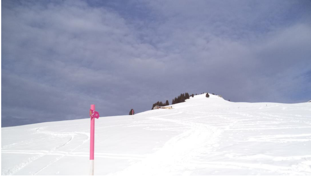
The final approach to the summit.