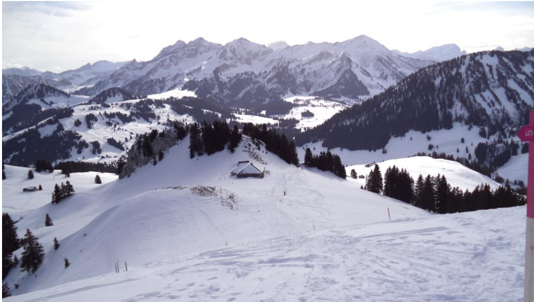
View of the trail up the summit from the top.