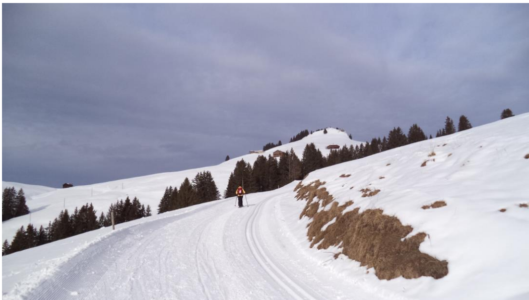
About 2/3 of the route is a prepared road, very easy to hike along.