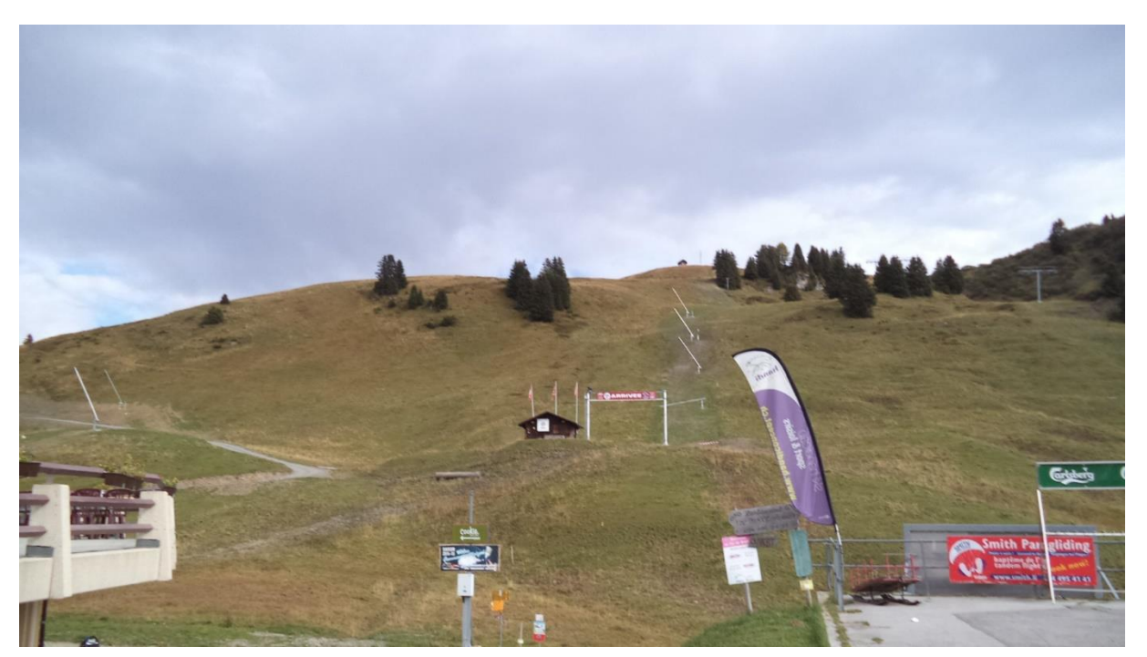
On the left side is the road leading up to VD-024, which is behind this hill.

We returned to the train station and then went on our way to VD-024 Chaux Ronde. As you can see on the map, there is no official hiking trail to the summit. We followed a dirt service road to Point 1987 and then hiked up the hillside. The total hike was 2.2 km, 269 meters of elevation and it took 51 minutes. Fortunately, it late enough in the year that the cows were down from the pastures and we didn't have to deal with them or fences. Here the activation zone is quite large, but there is nothing at all you can use for mast supports except for a shrub here and there.