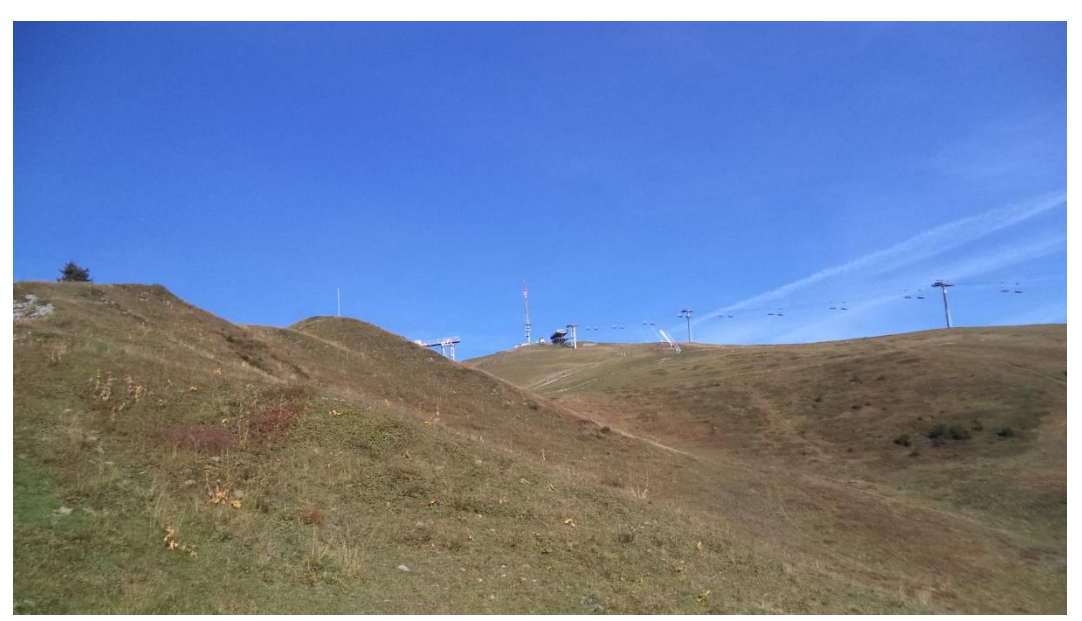
First view of VD-020 (the communications tower in the center) from the service road.