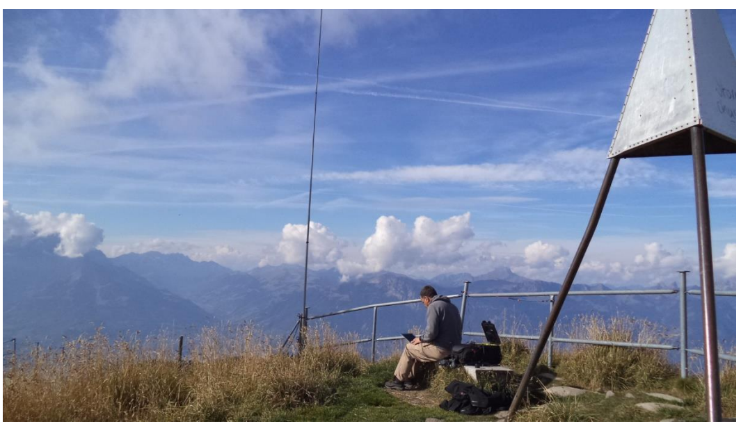
Hans PB2T operating from one of the two log benches in the activation zone.

We returned to the train station and then went on our way to VD-024 Chaux Ronde. As you can see on the map, there is no official hiking trail to the summit. We followed a dirt service road to Point 1987 and then hiked up the hillside. The total hike was 2.2 km, 269 meters of elevation and it took 51 minutes. Fortunately, it late enough in the year that the cows were down from the pastures and we didn't have to deal with them or fences. Here the activation zone is quite large, but there is nothing at all you can use for mast supports except for a shrub here and there.