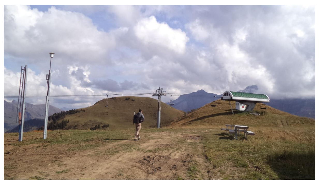
First view of VD-024, the hillside visible just to the left of the chair lift support mast.