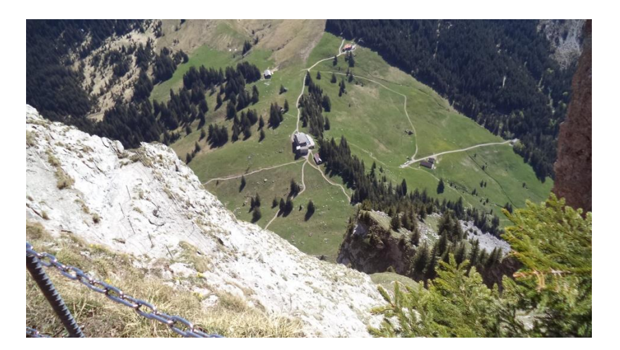
Looking down on the cable car summit station from near the peak of Grosser Mythen.