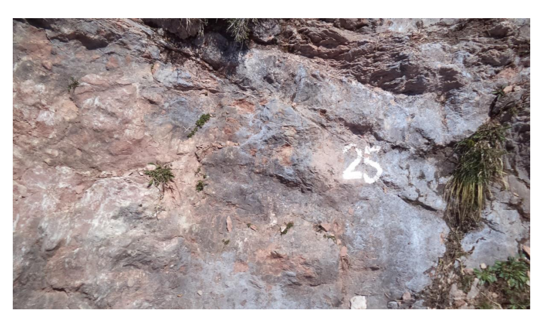
Some of the 47 switchbacks are marked -- I've done only 25 so far?!? See the waypoint "Switchback 25" on the GPS track. It's at an elevation of 1694 meters, somewhat more than half way up.