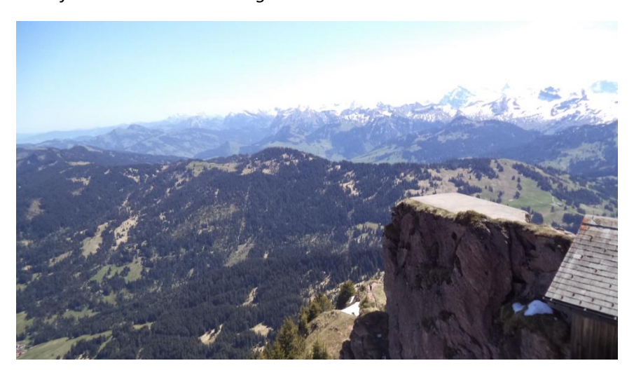
View looking northeast including HB/SZ-025 (in the middle), an easy activation.

Further activations: If you have the time and energy, there is another nearby peak. Because it is so close by, you first might be tempted to hike up Kleiner Mythen HB/SZ-020 -- but think twice. Despite its name "Smaller Mythen", it is technically much more difficult and suited only for very experienced hikers; at the time of this writing, Grosser Mythen was activated 12 times, and Kleiner Mythen only 4 times. A far easier alternative is Furggelenstock HB/SZ-025, about 4 km away, and basically a gentle climb with no exposed areas at all.