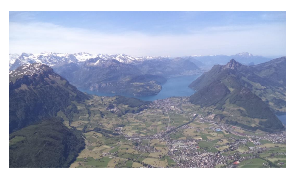
View from the summit looking southwest onto Lake Lucerne