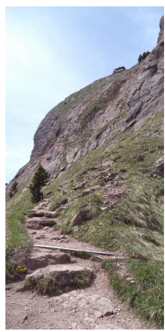
The stone bench (see waypoint "Bench" on the map), about 2/3 of the way up, and the view to the summit from the bench.