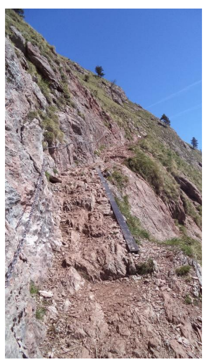
Perhaps the trickiest parts of the entire climb