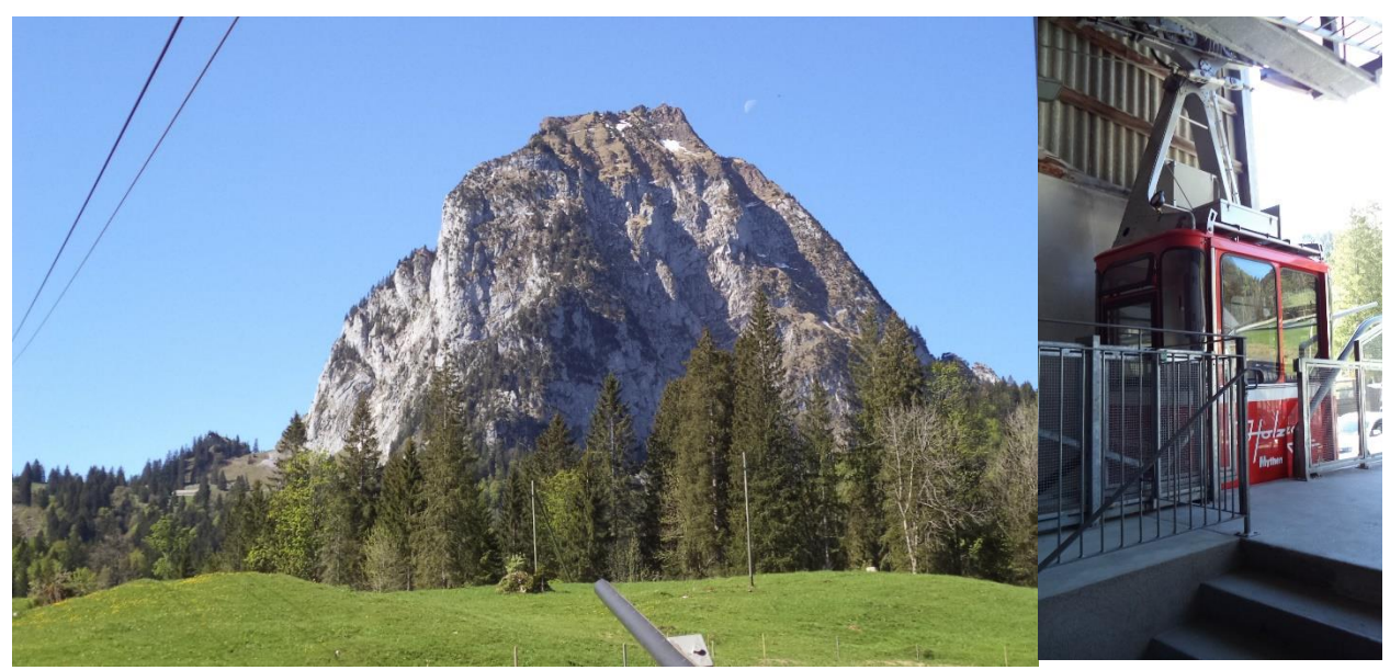
View of Grosser Mythen from the cable car station (left) and the cable car (holds 15 people, runs at least every half hour or more on demand).