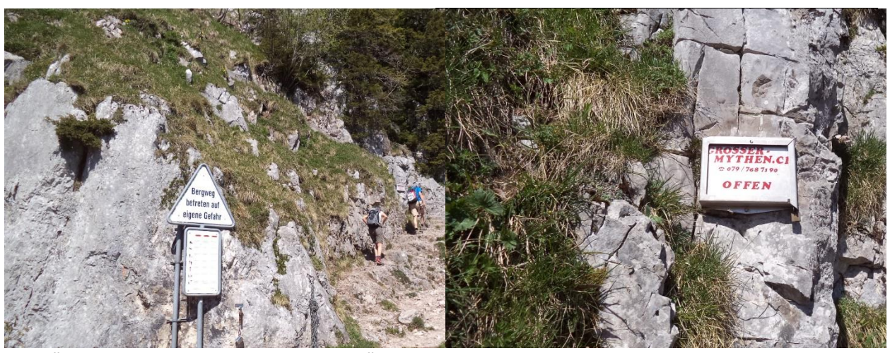
Sign: "Use mountain path at your own risk."