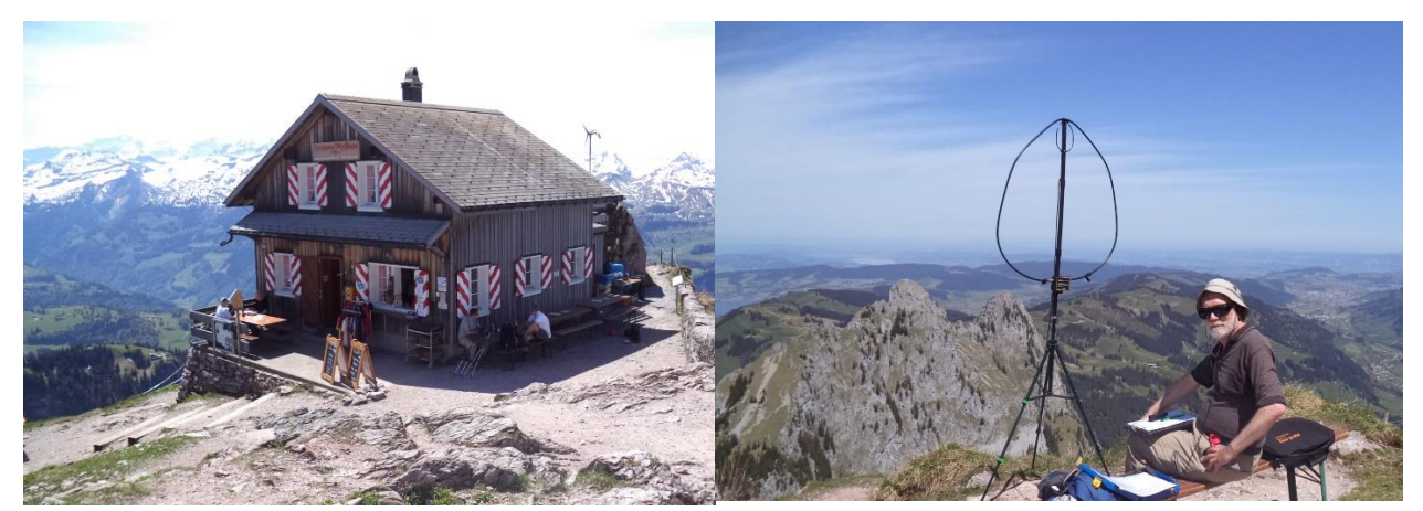
The summit restaurant with limited space for antennas. I put my loop on the far side away from the restaurant near the flagpole. In the background: Kleiner Mythen HB/SZ-020, only for very skilled hikers.

Activation zone: As noted, this is very small. It consists of a few meters on all sides of the restaurant (with picnic tables) and the actual summit area with the flagpole and summit cross. Because of this limited space, you might have some trouble setting up a dipole. I recommend using a vertical or, in my case, a magnetic loop.