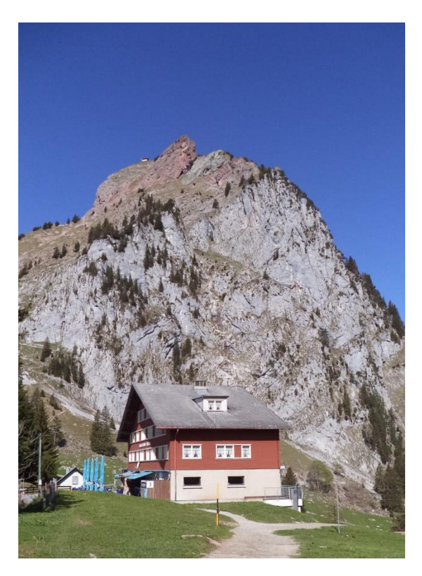
View of the upper cable car station/restaurant and Grosser Mythen. The summit restaurant is barely visible as a dot on the left side. At this point, you're likely to ask yourself, "What in the world was I thinking when I decided to activate this summit?!?"