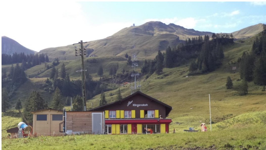
Chair lift up to Chlingenstock (SZ-017).

As mentioned, the trip starts at the car-free village of Stoos, which is an active winter resort. To get to Stoos, you can either take the funicular train from Schlattli (north of Stoos, bus service and some parking), or you take a cablecar from Morschach to the east of Stoos (bus service, parking). Note, the funicular is free if you have a SwissRail pass or equivalent. Also be aware that work is proceeding on a new funicular from Schlattli to replace the existing one. It will be ultra modern with cylindrical cars where the occupants are always level no matter how steep the funicular is traveling -- and that will be necessary because the new route will be as steep as 110 degrees -- claimed the world's steepest. This new funicular is scheduled to go into operation for the 2015/2016 winter season.