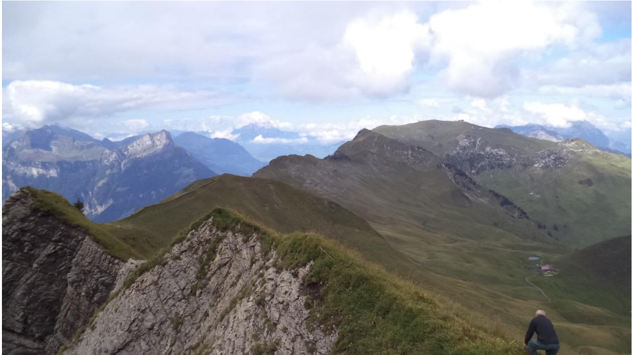
View of the ridge hike as seen from Chlingenstock. Towards the right you can see a tiny dot on a summit; this is the chair lift/restaurant at SZ-018 Fronalpstock. In the foreground is one of the volunteers who maintains the trail, which is always in very good shape.

hike with wonderful views of Lake Lucerne and many other mountain peaks. One of them is Grosser Mythen, HB/SZ-019, which is another of my top recommendations for visitors (see separate PDF report I wrote on that activation). In addition, there are several absolutely lovely spots with picnic tables where you can have a snack and enjoy the scenery.