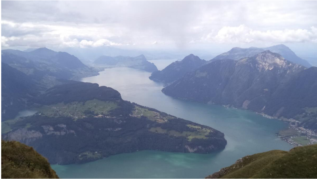
View of Lake Lucerne from the Fronalpstock restaurant deck.

After the activation, enjoy a beer or snack at the restaurant that is right next to the activation zone (it's probably even in the activation zone, but overrun with people). Then ride the chair lift back down to Stoos (note: you have to change from one chair lift to another in the middle of the ride down, all included in the price). Hike back to the funicular station, ride it down, and either hop in your car or wait for the bus (runs every half hour in the mid to late afternoon). This double-activation is an all-day trip, but well worth it! And it's even a good one to bring your spouse or partner along. It doesn't get much better than this in terms of beautiful SOTAs.