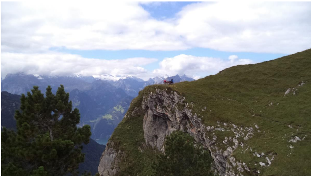
One of several spectacularly placed picnic tables along the ridge route.