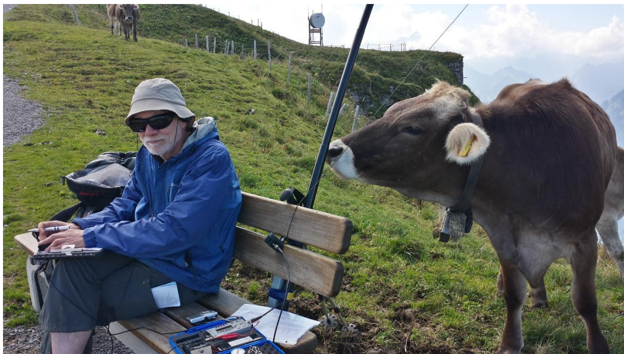
A curious cow checking my SWR while operating on Fronalpstock.