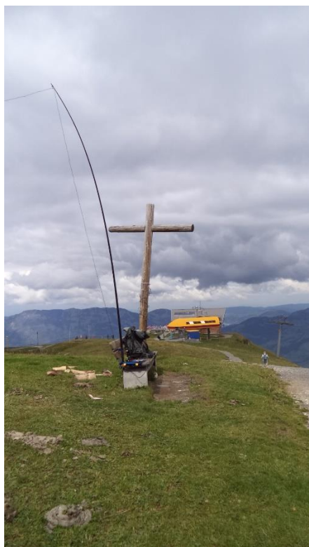
My operating position in the activation zone of HB/SZ-018 Fronalpstock; in the background the chair lift station and the restaurant.