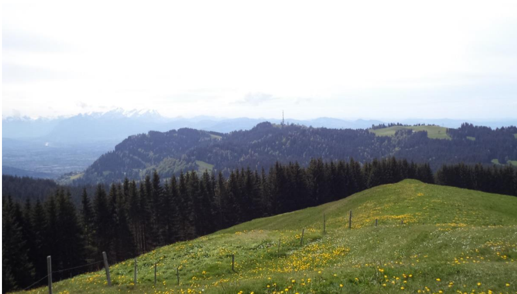
View from Hirschberg to Pfänder, look for the communications tower in the middle (summit 3 for the day).