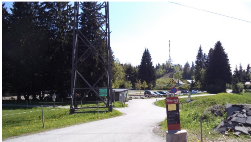
Moosegg parking lot; the Pfänder communications tower in the background.

Pfänder itself is easy – just take the cable car up, then a 10 minute hike to the summit. There are many restaurants in and around the summit area if you choose to have a beer or a snack. Getting to the cable car station from the main train station is also easy: Bus 1 (1.40 euros 1 way) goes directly to the valley station. The teller at the train station where I bought my ticket thought I was crazy because it's a 15 minute walk through the city to the cable car station, but I knew I had a long day ahead of me and bought the ticket anyway. The fee for a round trip on the cable car itself costs 11.80 euros; the trip is 6 minutes. For those of you who prefer to drive up close to Pfänder, there is the Moosegg parking lot, which you reach through Lochau; there is then a 20 - 30 minute walk to the Pfänder summit.