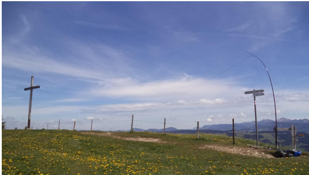
My station set-up on Hirschberg.

At the summit there is a cross, but because it has much metal on it that would disrupt my antenna, I chose to use a nearby fencepost for the mast support. In case of bad weather, there is also a chapel just off the summit that provides a windbreak and limited protection.