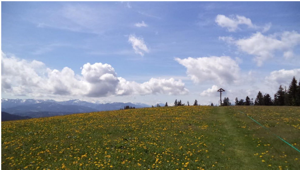
Final approach to Hochberg from the road through the pasture.