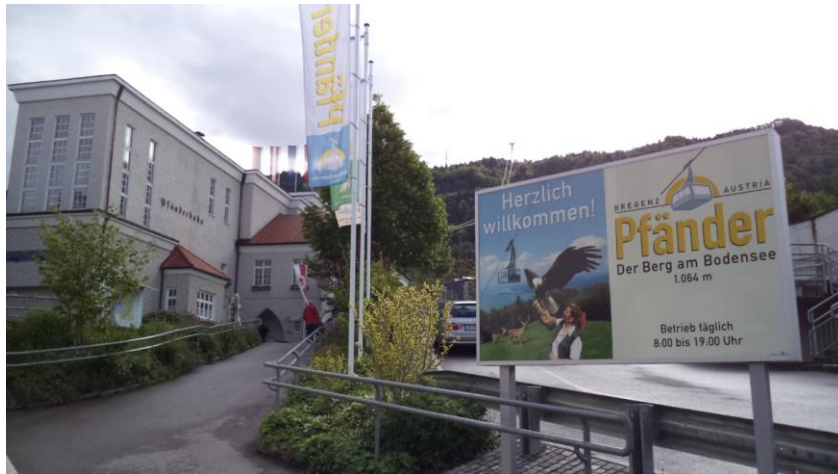
Pfänder cable car valley station