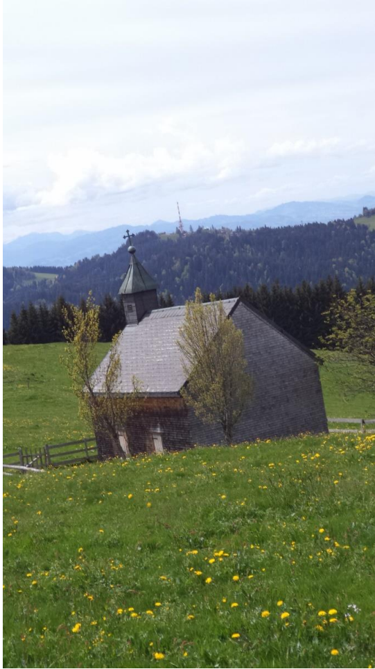
The chapel just off the Hirschberg summit.