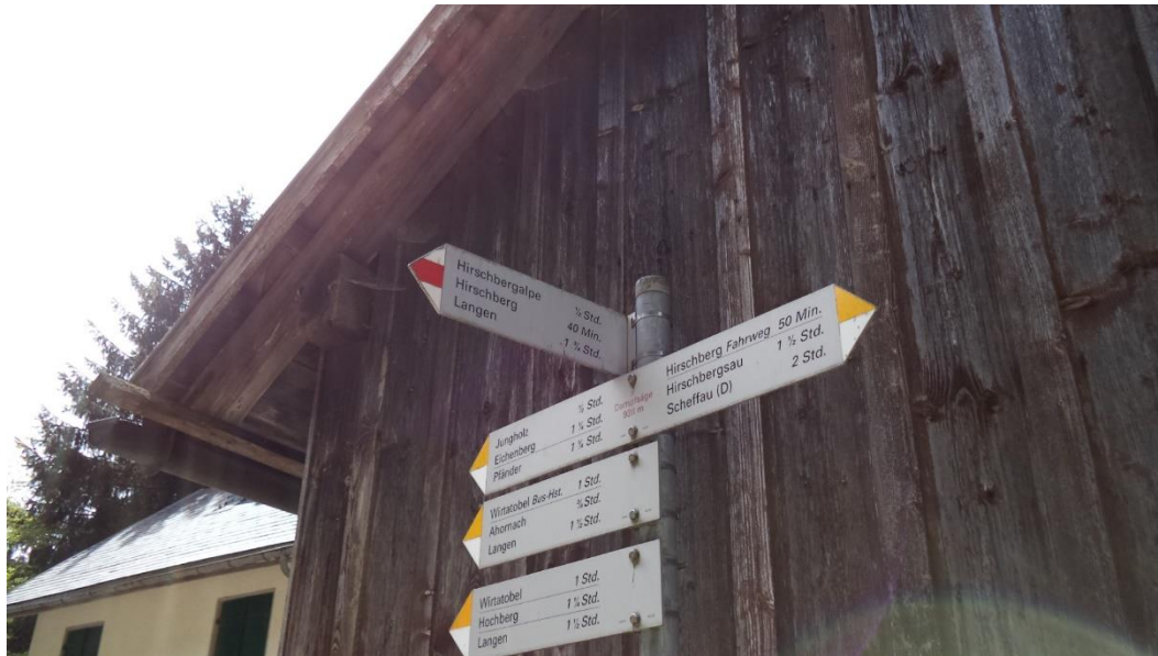
Map waypoint “Road (yellow arrow pointing right) or Trail (red arrow)”.

From Hochberg to Hirschberg takes a bit more effort. My hike time was 1h25, and it involves starting at the summit at 1069 m, dropping down into a valley at 882 m and then back up to the next summit at 1095 m – but even so, not terribly difficult. The first half is on roads. But at the point on the map marked “Road or trail” you have the option of taking one or the other (I took the trail through the woods, which if there is rain would be very wet on the feet and slippery).