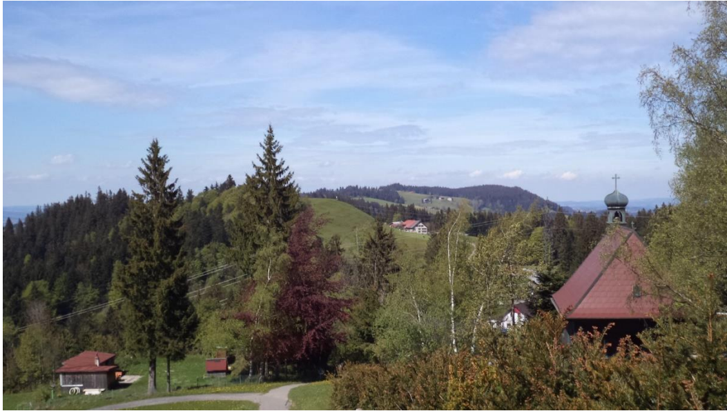
View from the starting point at Pfänder to summit 1, Hochberg (the pasture area on the far distant hill in the background).