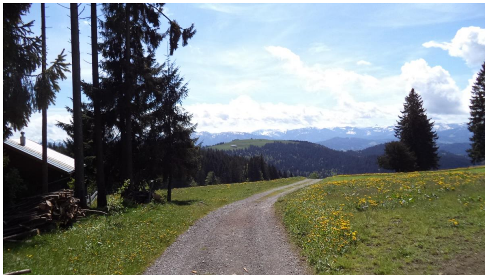
View from Hochberg to Hirschberg (summit 2 for the day, the green pasture area on the summit in the middle).

From Pfänder to Hochberg, my first summit of the day, it took me 1h15. This is following the Höhenweg trail. (Throughout the day I found all the trails to be very well marked, it's tough to get lost even without a map.) Most of it is on roads, much of that paved; only on the final approach do you march through a pasture. There is a bench to which I attached my mast as well as an attractive summit cross. Comment: This would be a good summit to bring along a partner guest who is not terribly athletic. The hike is not trivial but not difficult, and it would give them a good idea of what activating a SOTA is like. The views from the summit, while nice into the mountain scenery, do not include Lake Constance.