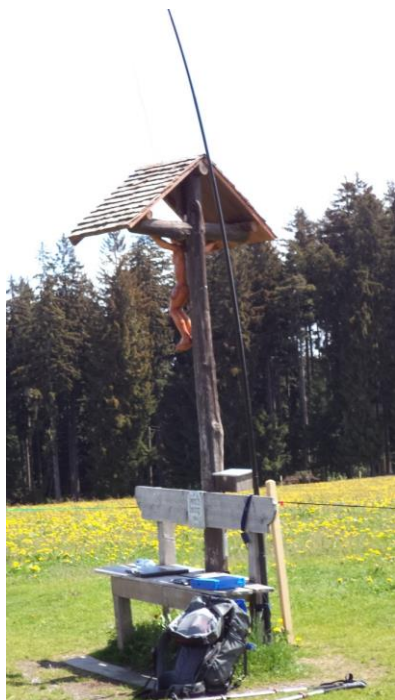
My station set-up on Hochberg.

From Pfänder to Hochberg, my first summit of the day, it took me 1h15. This is following the Höhenweg trail. (Throughout the day I found all the trails to be very well marked, it's tough to get lost even without a map.) Most of it is on roads, much of that paved; only on the final approach do you march through a pasture. There is a bench to which I attached my mast as well as an attractive summit cross. Comment: This would be a good summit to bring along a partner guest who is not terribly athletic. The hike is not trivial but not difficult, and it would give them a good idea of what activating a SOTA is like. The views from the summit, while nice into the mountain scenery, do not include Lake Constance.