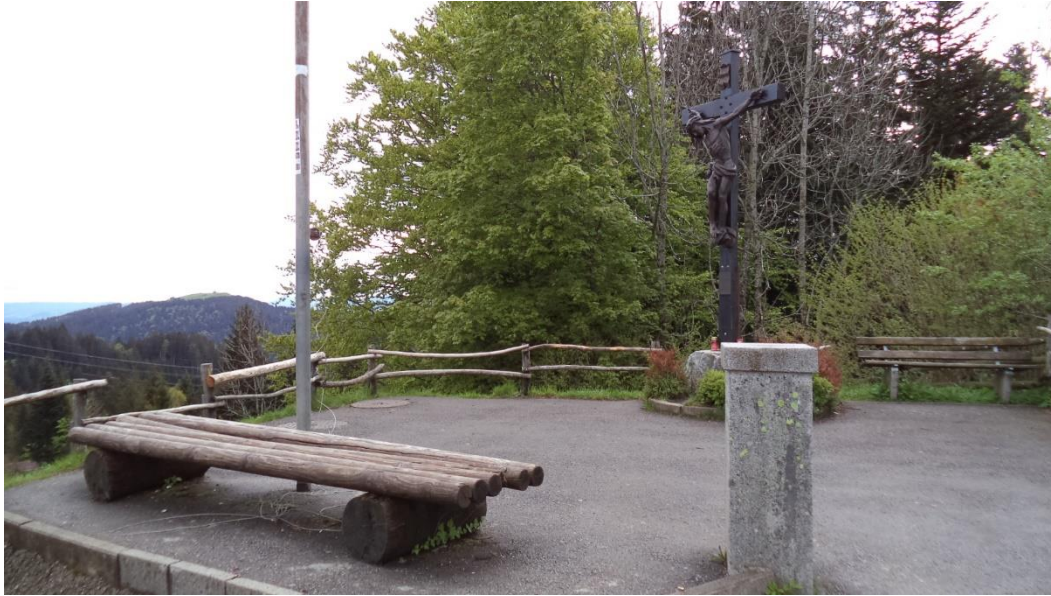
The actual Pfänder summit area. On a nice day, this small area can be packed with people.

From Hirschberg to Pfänder involves again going down into the valley at Point 882 and ascending up to 1064 m – again, not terribly tough. This hike took me 1h36. When you get there, the actual summit is very limited for space, and on a busy day you'll have trouble finding space for an antenna. Right near the massive communications tower there is an area with a number of benches. I chose to set up there. Yes, I had massive QRM from the tower, but even so I was easily able to work a pileup including two S2S contacts. In fact, during this day I had a total of ten S2S contacts. Interestingly, three of them were with DL/F5HTR/P – each time we were both on a different summit. All my operations were on 40m and 30m, and I always had the standard pileups to work through.