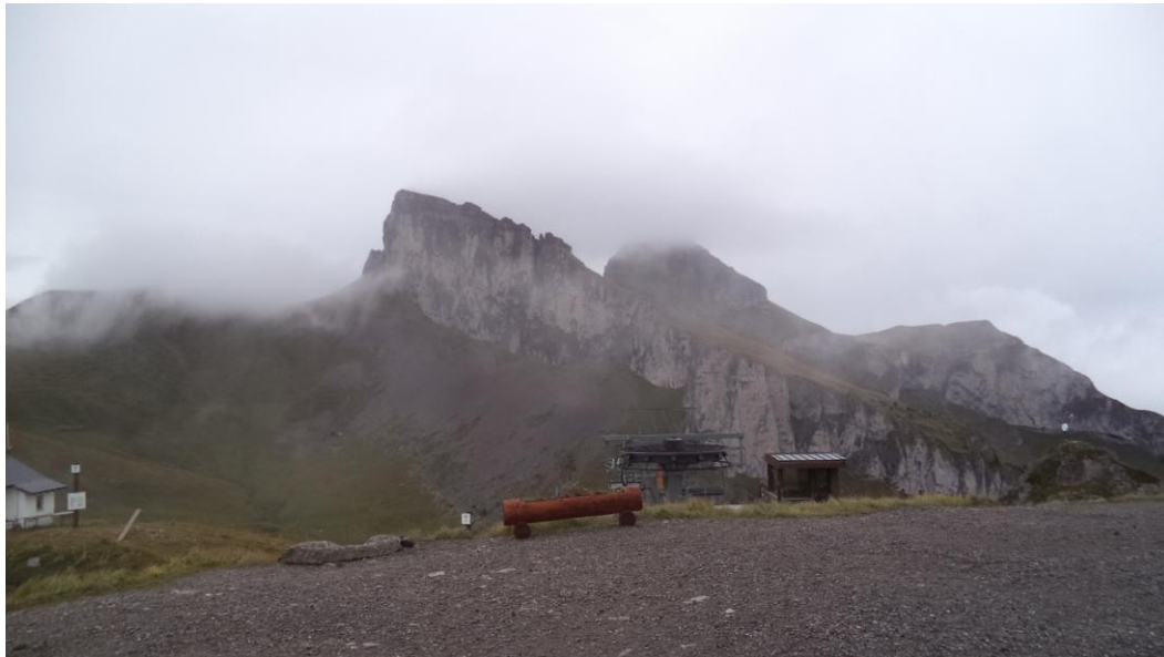
"The two towers of Leysin": The sharp peak to the left is VD-014, Tour d'Ai; to its immediate right is VD-045, Tour de Mayen. Those two along with Berneuse (VD-022) should be possible if you get an early start in the morning.

If the weather had been sunny and dry, we would have probably also activated VD-014, Tour d'Ai (2.5 km, 1 hour 45 minutes, 303 meters elevation). It involves a steep grassy slope, and we knew even before we got to the cablecar station that VD-014 would be impossible on this trip and would have to wait for a later day.