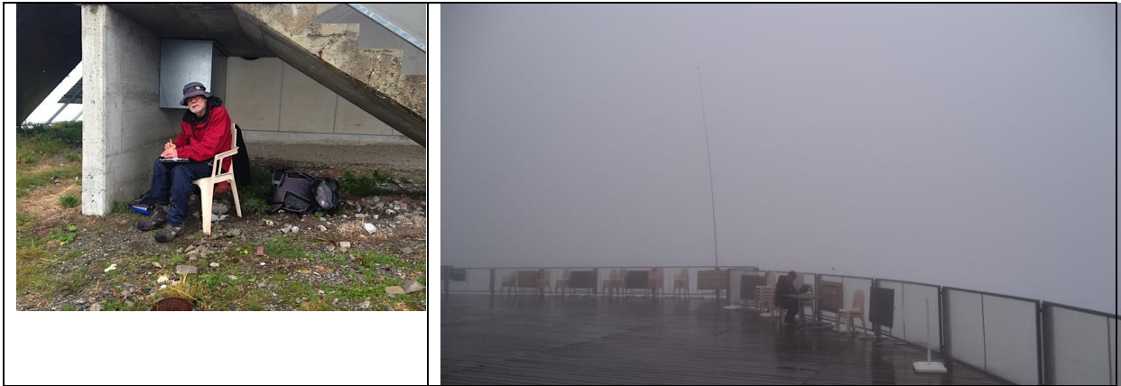
HB9DST underneath a stairway protected from the wind and rain, PB2T on the terrace.

If the weather had been sunny and dry, we would have probably also activated VD-014, Tour d'Ai (2.5 km, 1 hour 45 minutes, 303 meters elevation). It involves a steep grassy slope, and we knew even before we got to the cablecar station that VD-014 would be impossible on this trip and would have to wait for a later day.