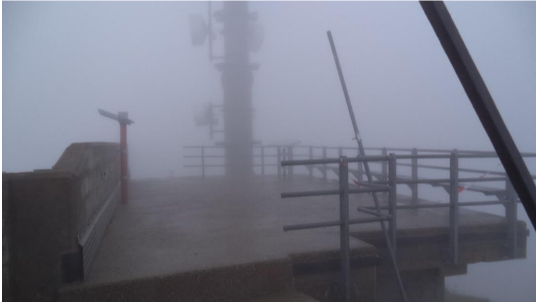
What a lovely day for an activation... (VD-023)

starting to clear, dark rain clouds were covering all the peaks. To be concise, it was just downright miserable. Dense fog with sight of about 20 meters. Constant drizzle and at times heavy rain. At least, though, the temperature was well above freezing (7 deg C) and I had more than enough clothing.