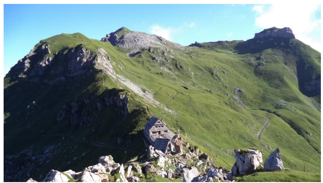
Looking up to Augstenberg, our warm-up summit, from the hut.

We removed our overnight materials from the backpacks and then hiked up Augstenberg (another 211 meters) as a warm-up activation for the next day. The weather was somewhat cloudy, which is not bad for an ascent, and this activation also gave us some great views of Naafkopf and Malbun.