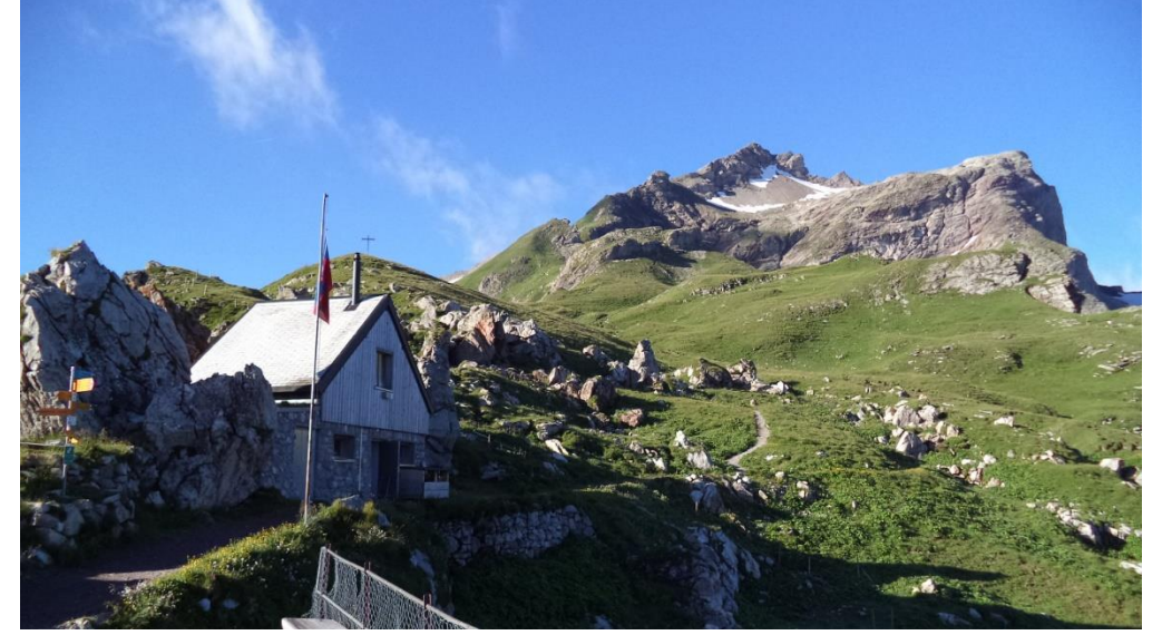
Looking up to Naafkopf – our destination for Saturday – from the hut.

We had breakfast at about 8 a.m. on Saturday and made our way to Naafkopf. It turned into a beautiful sunny day (dry trail!). A friend had been up there two weeks before and had the last remnants of snow on the trail, but we found it totally clear of snow. The hike up is generally OK, just one section on a hillside where it's pretty exposed, and you need to take steps carefully. The last section is somewhat steep, requires the occasional use of hands, but nothing especially dangerous. Ascent 462 meters.