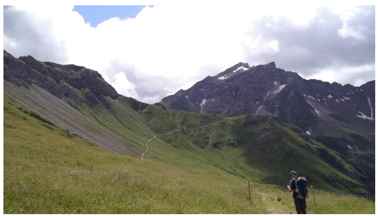
On the way up to the Pfälzerhütte.