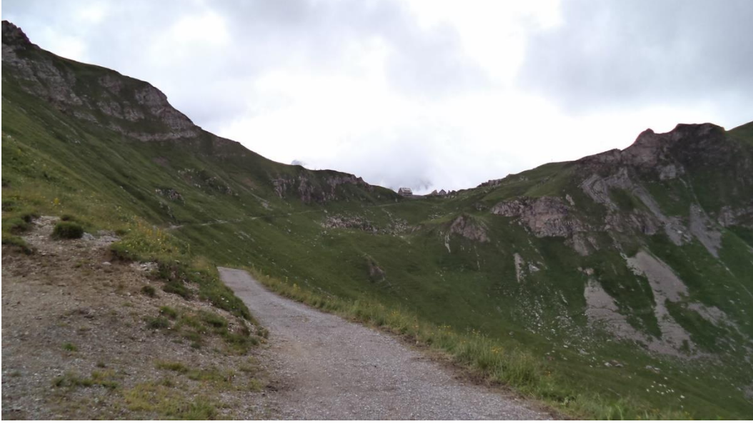
The hut is finally in sight...