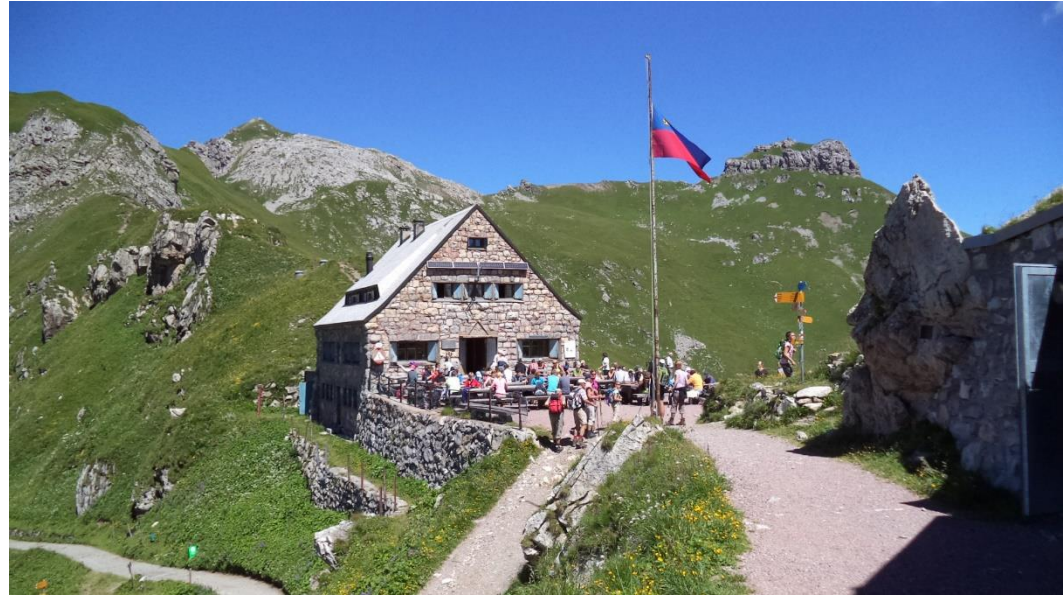
... and on a nice day there is plenty of activity.

We removed our overnight materials from the backpacks and then hiked up Augstenberg (another 211 meters) as a warm-up activation for the next day. The weather was somewhat cloudy, which is not bad for an ascent, and this activation also gave us some great views of Naafkopf and Malbun.