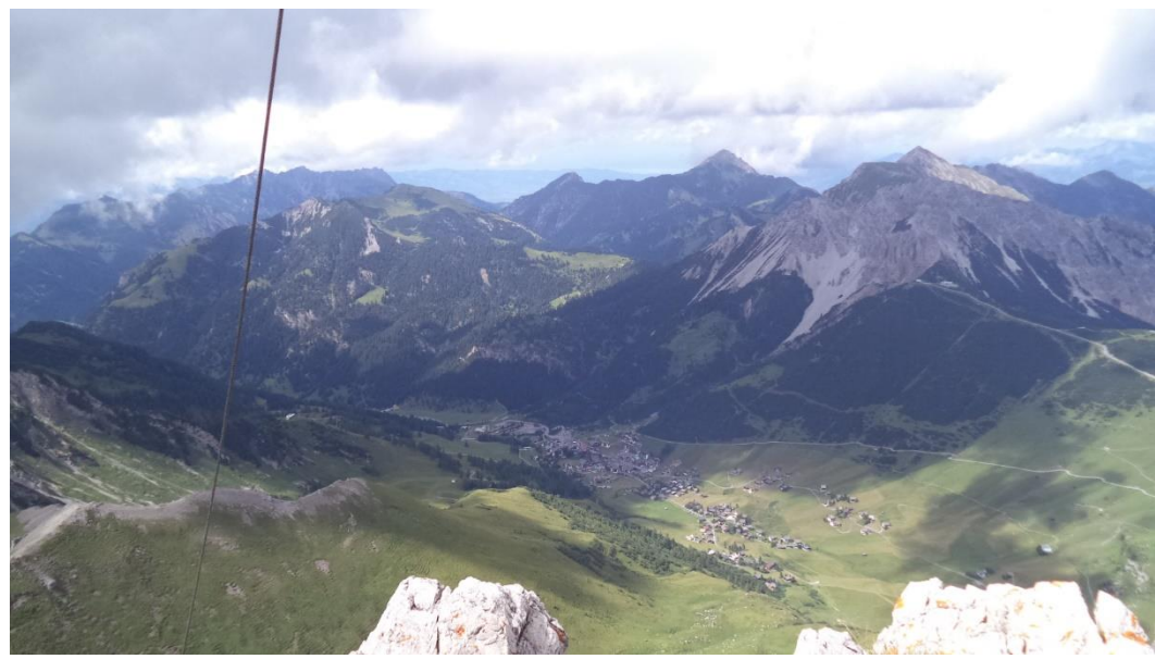
Malbun as seen from Augstenberg – this is what we climbed on the first day.

We had a very pleasant evening/night in the hut. We purchased our evening meal (basic pasta with sausage and vegetables), had a beer or two (or three – what else is there to do up there?) and went to our room. The hut was busy but not packed. We managed to get a double room for ourselves rather than sleeping in the group bunk rooms, a nice convenience. That was likely due to the fact we stayed over on Friday night; I'm sure on Saturday night the place is booked solid. Anyway, after a long day, we slept very well.