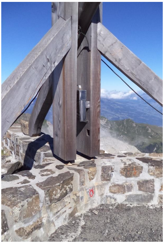
Here's the marker indicating the Austrian side of the 3-legged wall.

The trip down to the hut was non-eventful. Again, we packed up our overnight stuff into our backpacks and made our way down to Malbun. We were tempted to activate another summit on the way down, but instead we opted to stop on the way home to activate HB/GR-121 (Regitzer Spitz) because I was anxious to check summits off on my quest for Edelweiss #1 (which I did eventually get).