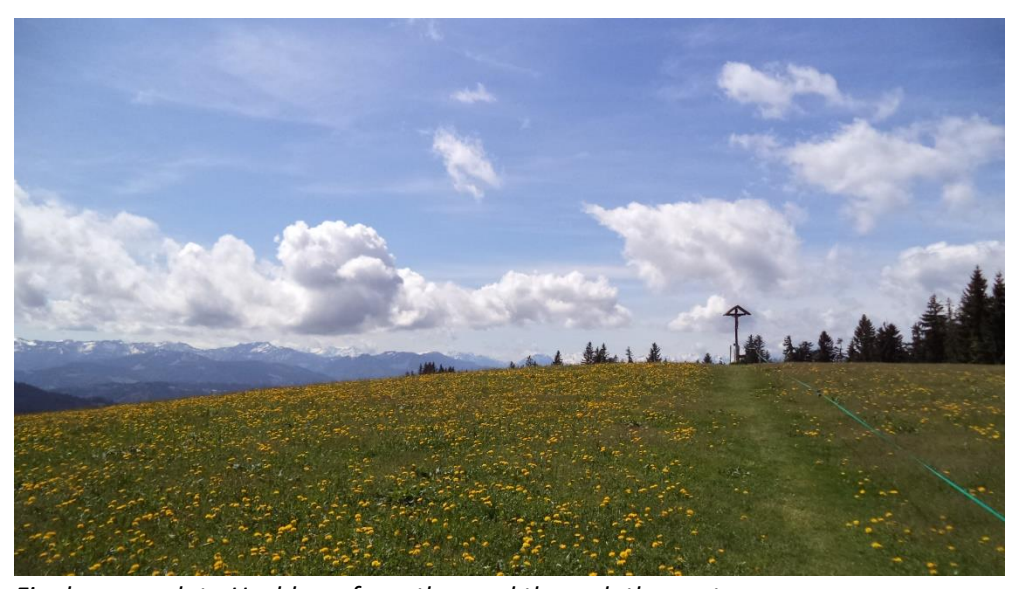
Final approach to Hochberg from the road through the pasture.