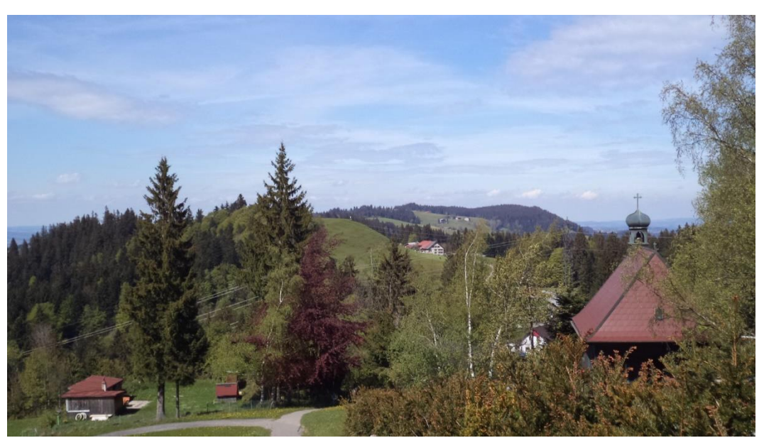
View from the starting point at Pfänder to summit 1, Hochberg (the pasture area on the far distant hill in the background).