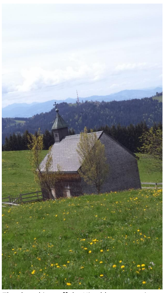
The chapel just off the Hirschberg summit.