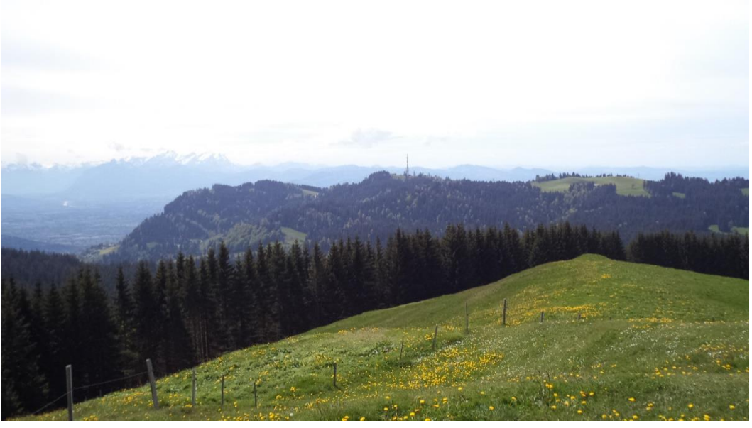
View from Hirschberg to Pfänder, look for the communications tower in the middle (summit 3 for the day).