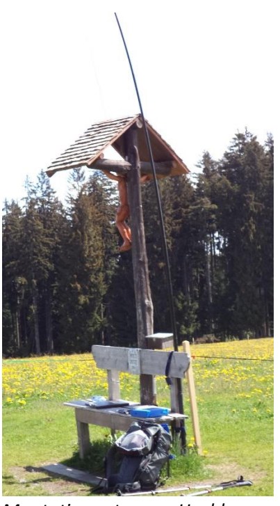
My station set-up on Hochberg.

From Pfänder to Hochberg, my first summit of the day, it took me 1h15. This is following the Höhenweg trail. (Throughout the day I found all the trails to be very well marked, it's tough to get lost even without a map.) Most of it is on roads, much of that paved; only on the final approach do you march through a pasture. There is a bench to which I attached my mast as well as an attractive summit cross. Comment: This would be a good summit to bring along a partner guest who is not terribly athletic. The hike is not trivial but not difficult, and it would give them a good idea of what activating a SOTA is like. The views from the summit, while nice into the mountain scenery, do not include Lake Constance.