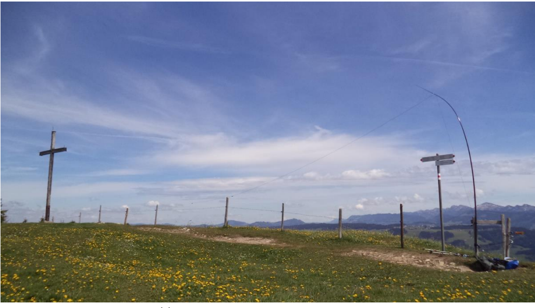
My station set-up on Hirschberg.

At the summit there is a cross, but because it has much metal on it that would disrupt my antenna, I chose to use a nearby fencepost for the mast support. In case of bad weather, there is also a chapel just off the summit that provides a windbreak and limited protection.