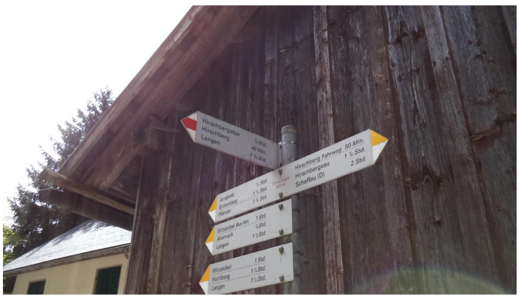
Map waypoint "Road (yellow arrow pointing right) or Trail (red arrow)".

From Hochberg to Hirschberg takes a bit more effort. My hike time was 1h25, and it involves starting at the summit at 1069 m, dropping down into a valley at 882 m and then back up to the next summit at 1095 m – but even so, not terribly difficult. The first half is on roads. But at the point on the map marked "Road or trail" you have the option of taking one or the other (I took the trail through the woods, which if there is rain would be very wet on the feet and slippery).