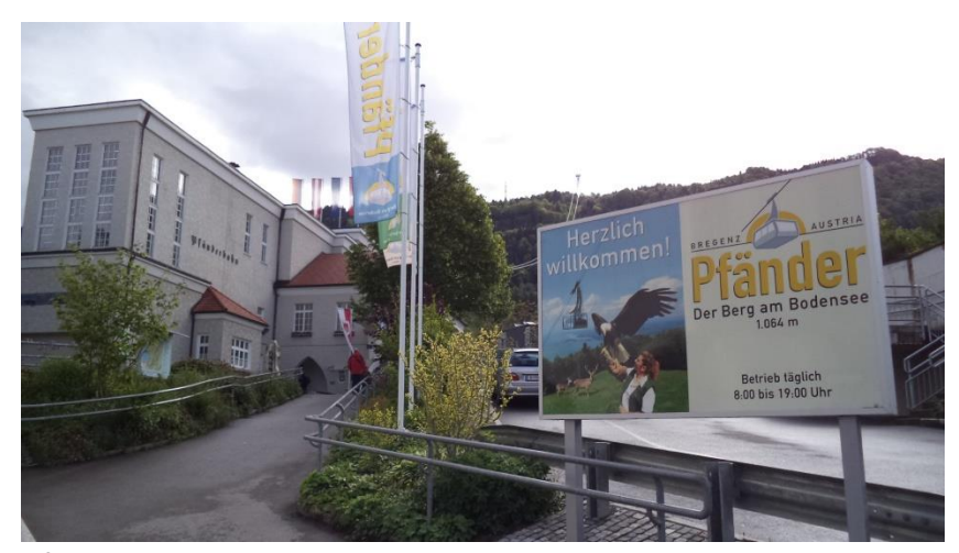
Pfänder cable car valley station

all three in one day. Not counting time for the activations themselves, I ended up hiking for just over 4 hours (the tourist brochure estimates 5 hours, but I take few breaks), covering 17 km. None of it was particularly tough, just long.