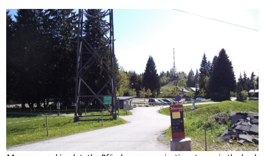
Moosegg parking lot; the Pfänder communications tower in the background.

Pfänder itself is easy – just take the cable car up, then a 10 minute hike to the summit. There are many restaurants in and around the summit area if you choose to have a beer or a snack. Getting to the cable car station from the main train station is also easy: Bus 1 (1.40 euros 1 way) goes directly to the valley station. The teller at the train station where I bought my ticket thought I was crazy because it's a 15 minute walk through the city to the cable car station, but I knew I had a long day ahead of me and bought the ticket anyway. The fee for a round trip on the cable car itself costs 11.80 euros; the trip is 6 minutes. For those of you who prefer to drive up close to Pfänder, there is the Moosegg parking lot, which you reach through Lochau; there is then a 20 - 30 minute walk to the Pfänder summit.