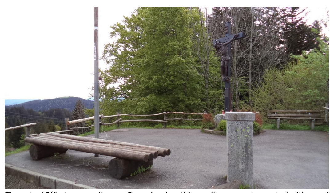
The actual Pfänder summit area. On a nice day, this small area can be packed with people.

From Hirschberg to Pfänder involves again going down into the valley at Point 882 and ascending up to 1064 m – again, not terribly tough. This hike took me 1h36. [[Ignore text starting here: Pfänder no longer a valid SOTA summit]] When you get there, the actual summit is very limited for space, and on a busy day you'll have trouble finding space for an antenna. Right near the massive communications tower there is an area with a number of benches. I chose to set up there. Yes, I had massive QRM from the tower, but even so I was easily able to work a pileup including two S2S contacts. In fact, during this day I had a total of ten S2S contacts. Interestingly, three of them were with DL/F5HTR/P – each time we were both on a different summit. All my operations were on 40m and 30m, and I always had the standard pileups to work through.