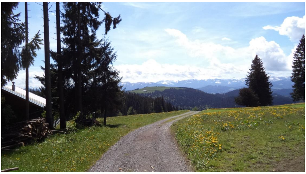
View from Hochberg to Hirschberg (summit 2 for the day, the green pasture area on the summit in the middle).

From Pfänder to Hochberg, my first summit of the day, it took me 1h15. This is following the Höhenweg trail. (Throughout the day I found all the trails to be very well marked, it's tough to get lost even without a map.) Most of it is on roads, much of that paved; only on the final approach do you march through a pasture. There is a bench to which I attached my mast as well as an attractive summit cross. Comment: This would be a good summit to bring along a partner guest who is not terribly athletic. The hike is not trivial but not difficult, and it would give them a good idea of what activating a SOTA is like. The views from the summit, while nice into the mountain scenery, do not include Lake Constance.