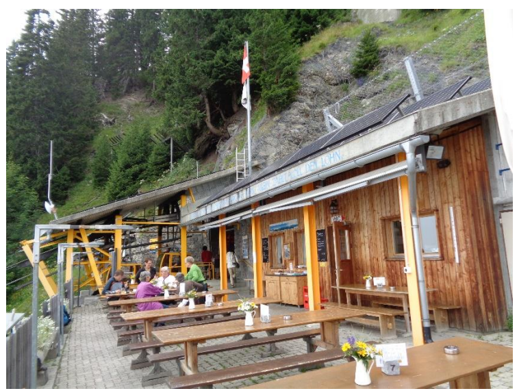
Cablecar summit station. This is where you wait until your scheduled seat leaves.

A large number of people who ride the cablecar also hike up to Vilan, so expect a crowd on the trail and the summit. If you want solitude, this is not the hike for you.