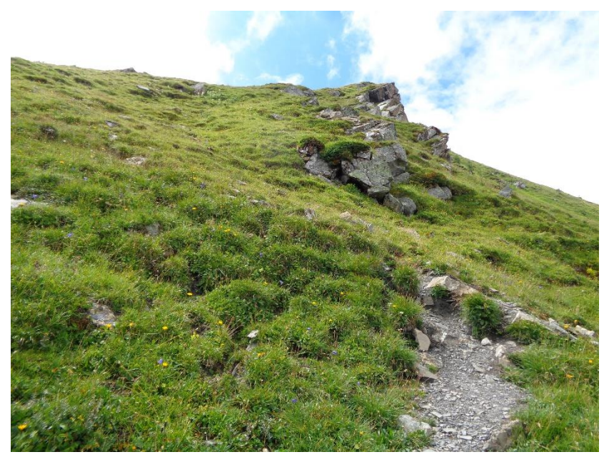
This is as steep as it gets -- so you can see there is nothing dangerous at all about this hike -- except mud when there has recently been rain or snow.