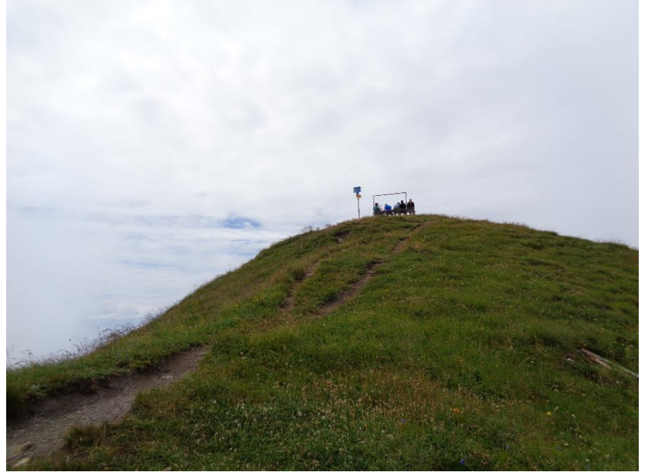
The activation zone is relatively large...

The activation zone is relatively large, but as noted before you will inevitably find a large number of people on the summit. There are ample opportunities for lashing a mast.