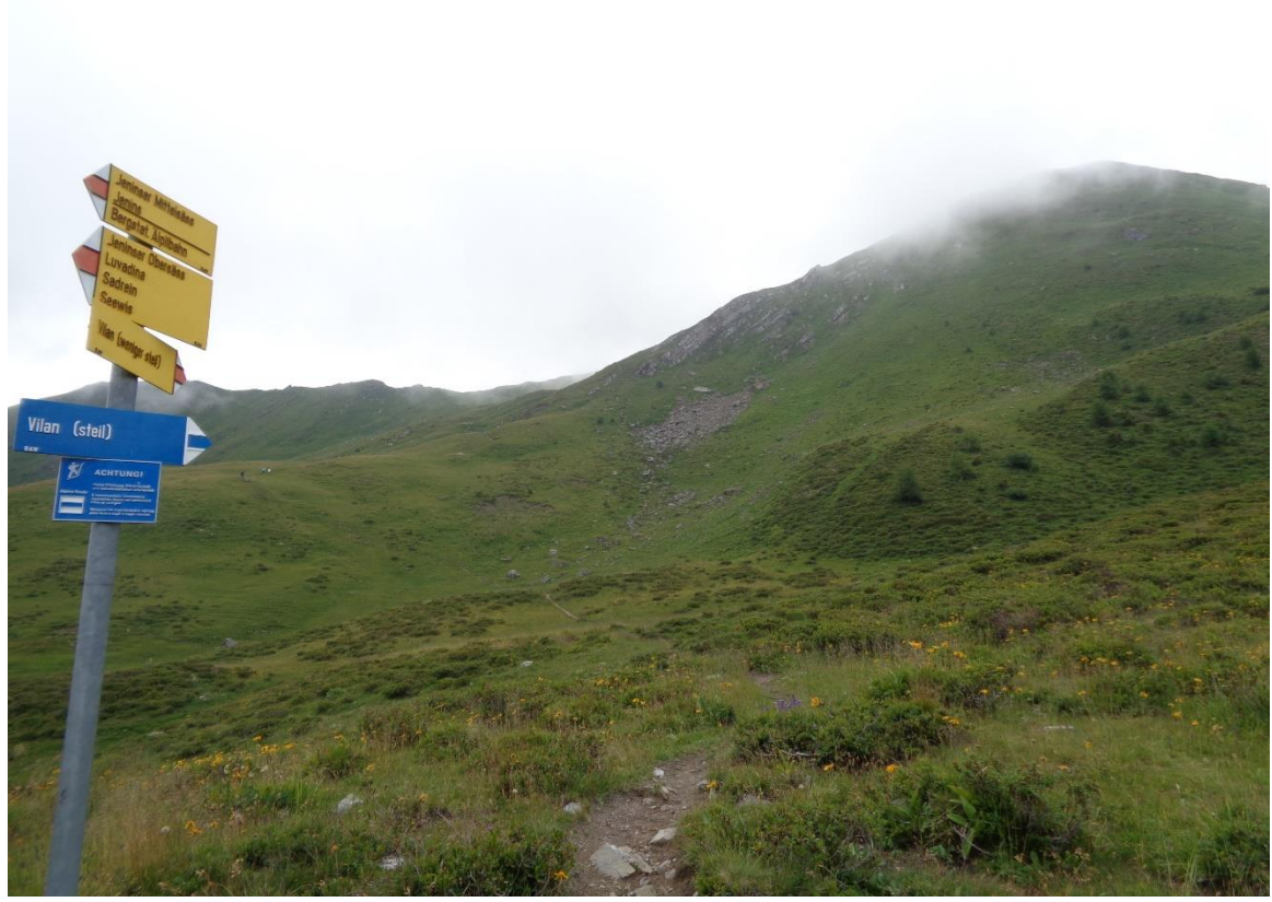
The sign at the fork at Point 2091. The blue sign pointing to the western approach says "Vilan (steep)" and is a blue/white Alpine route. The red/white eastern approach to Vilan is marked "less steep". Note that what you see here is not the final peak, which is hidden from sight by this secondary peak.