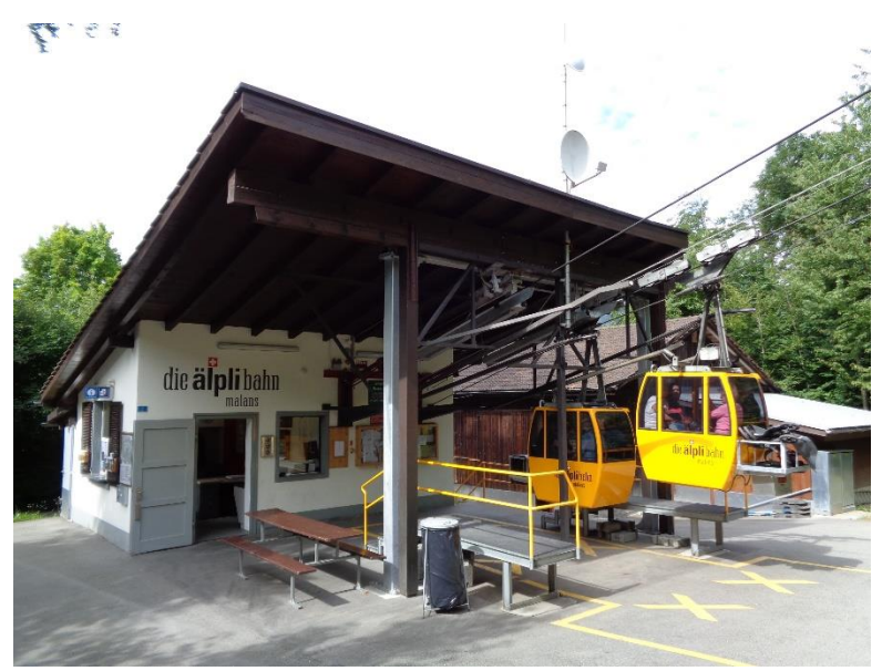
Cablecar valley station on the outskirts of Malans. Maximum capacity is 8 persons (4 in each car).

Vilan is about as easy as a 600 meter ascent gets, which explains why there were so many people on the summit even on a foggy weekday. I would rate it as a T2.