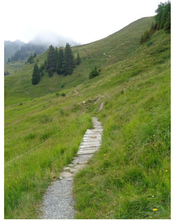
The middle section of the hike along the Ortasee. The wooden walkways tell me that this area can be quite muddy if there has been rain recently.

times, but nothing that a seasoned activator hasn't already seen many times before. The posted time for the hike is 2 hours, but I made it in just over 90 minutes. The overall ascent was 621 meters, and the length of the route is 3.4 km. Note that in early October there was already a tiny bit of snow on the ground, and it made the hiking path muddy and very slippery on the steeper parts.