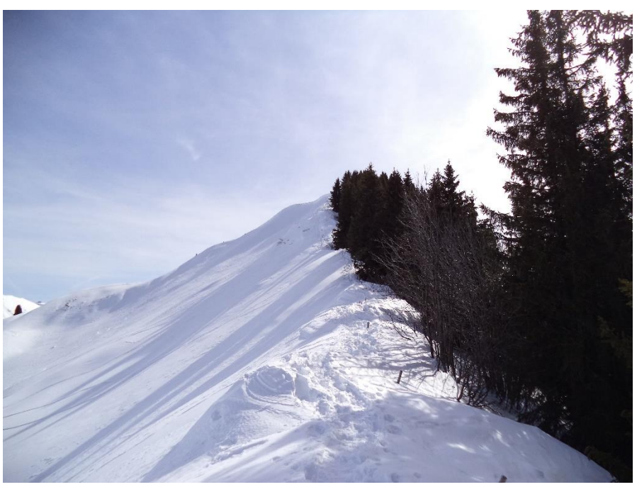
A closer look at the trail going up. From this it's hard to tell how really steep it is near the top.

Thus, attempt this only if conditions are excellent. If there is any chance you will not have good footing, such as due to new snow, drifting snow, or warm temperatures leading to slushy snow, I strongly urge you NOT to attempt this summit. Also be very cautious of snow cornices that might develop, and be sure to check the avalanche report at www.slf.ch/lawinenbulletin/lawinengefahr/index_EN -- and if the level is anything higher than "2", I would also stay away.