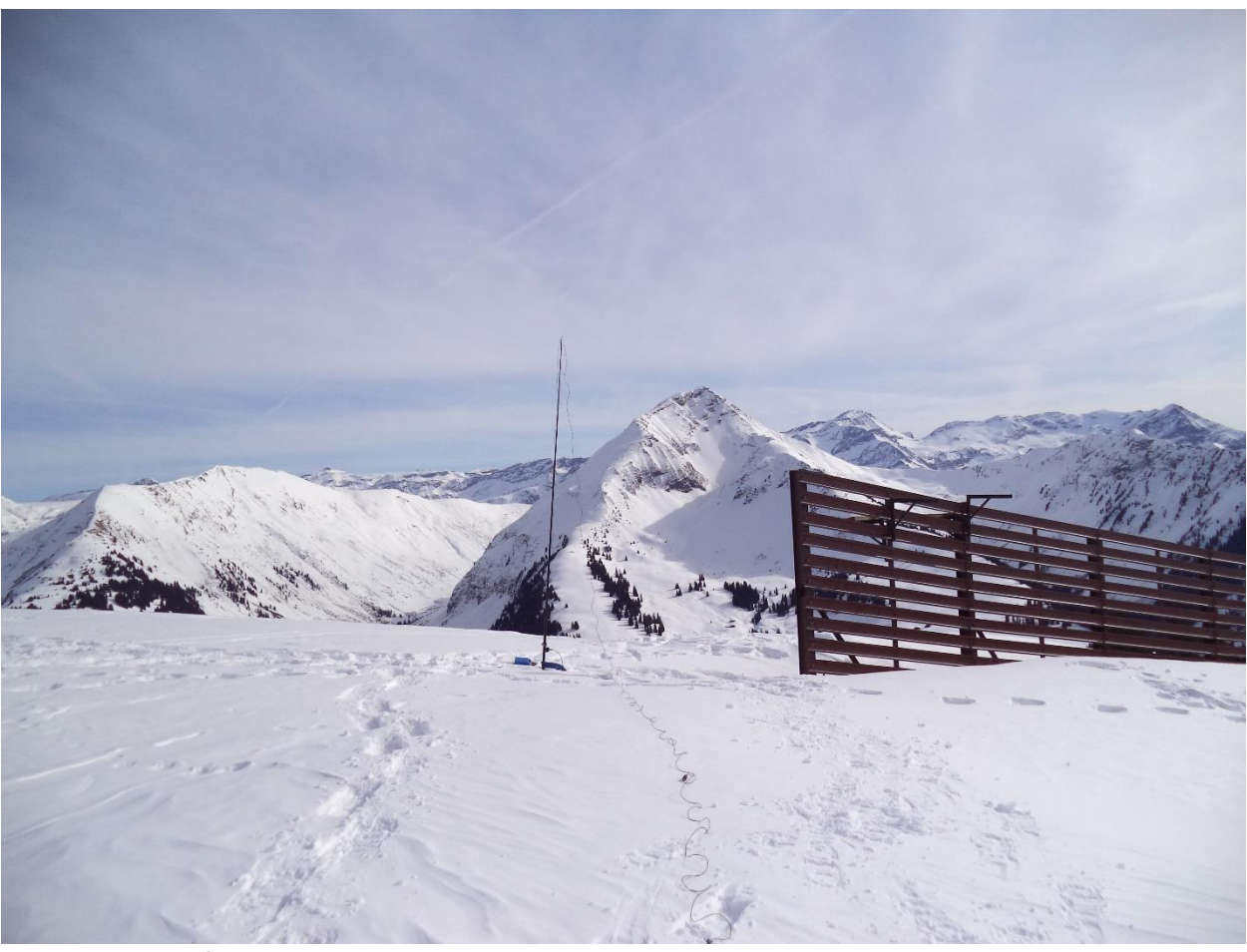
This metal snow fence is the only support in the activation zone.

Keeping in mind when the gondola stops running, I had a rather abbreviated activation on 7 MHz. The trip down went fast, but it was very, very tricky. Going up wasn't really too bad, but on the way down getting good footing in late-day soft snow was difficult. Fortunately, I made it down without any major incidents.