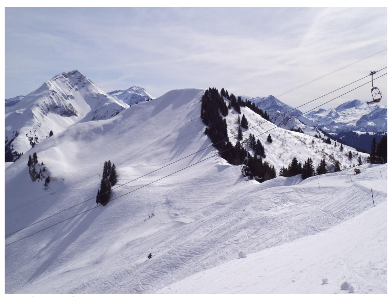
View of Horntube from the gondola station.

Further, the gondola station is where you get your first view of Horntube; the trail follows along to the left of the line of trees.