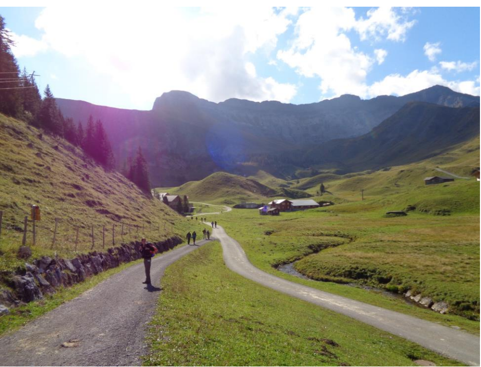
View when you get off the gondola at the summit station. On the left is a nice restaurant for a start-up coffee before the activation or a beer afterwards.

This hike starts at the Elsigbach gondola station, which has limited parking. Note for those taking public transportation: From the train station at Frutigen, you take two buses. The second of these (actually a mini-bus) has a very limited schedule and must be reserved in advance. I didn't know this, but because it was such a nice day there were other people making the same trip who did reserve the bus. The fare for this shuttle is CHF 10.00 round trip.