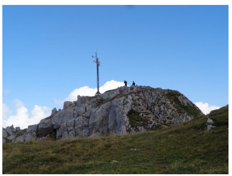
The actual summit, including the instrument tower to which I lashed my mast. There are no other convenient supports on the summit (no summit cross).

The entire 3.6 km hike up involved an ascent of 550 meters and took 90 minutes. It was all T2. In fact, on the summit (relatively crowded even on a weekday, partly because of the beautiful weather that day and partly because it is so relatively easy) I encountered my first blind mountain hiker. For antenna supports there is no summit cross but instead an instrument tower to which I attached my mast.