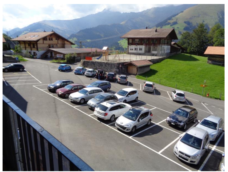
Parking lot at the gondola base station.

This hike starts at the Elsigbach gondola station, which has limited parking. Note for those taking public transportation: From the train station at Frutigen, you take two buses. The second of these (actually a mini-bus) has a very limited schedule and must be reserved in advance. I didn't know this, but because it was such a nice day there were other people making the same trip who did reserve the bus. The fare for this shuttle is CHF 10.00 round trip.