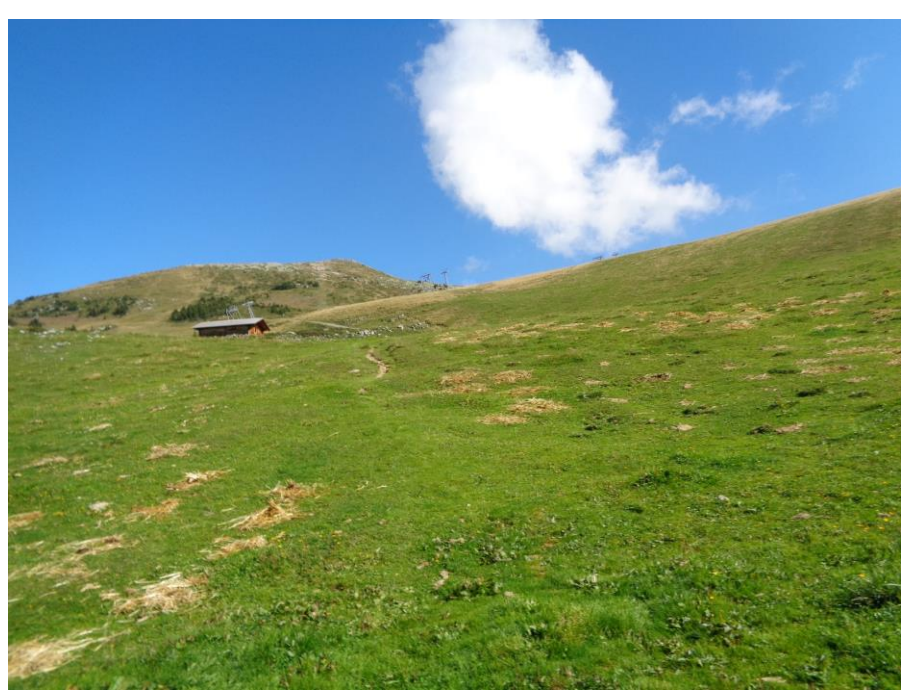
At point 1932 you leave the paved road and start up a hiking trail leading to the summit.

The gondola ride (CHF 14.00 round trip) takes about 10 minutes and goes to the top station at Senggi. From here you follow a paved road to Obere Elsig at Point 1932. Then you make a bee-line on easy trails up to the summit. About half-way up you can see a very large radar reflector (I think?) that is located just below the main summit.