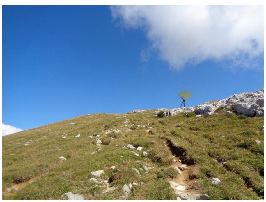
I'm guessing this object is a radar reflector. It is quite large and you can see it starting at about halfway through the hike. The actual summit is just over the horizon, about 10 minutes away.