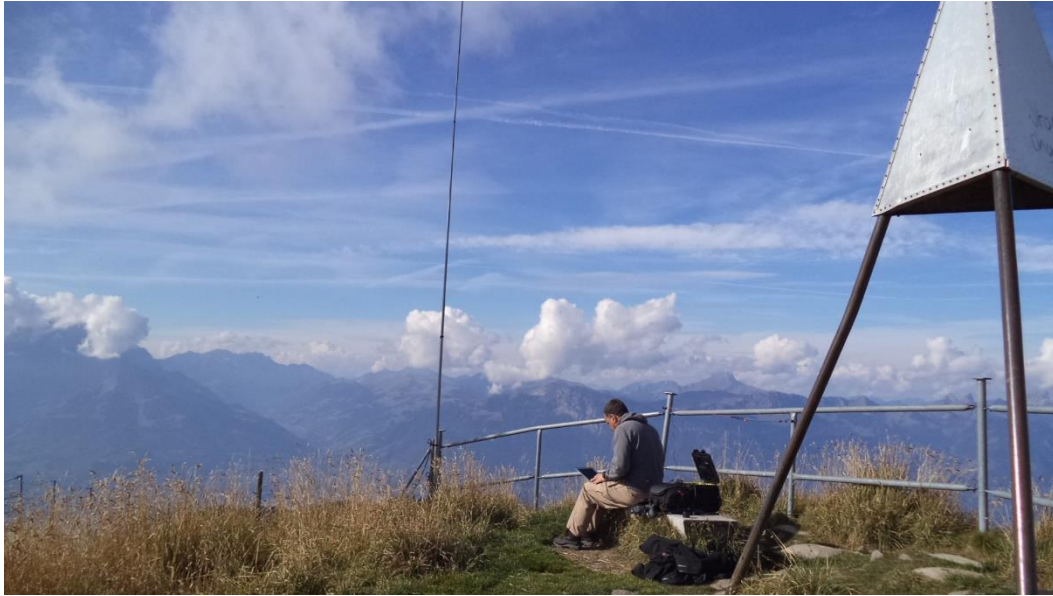
Hans PB2T operating from one of the two log benches in the activation zone.

We returned to the train station and then went on our way to VD-024 Chaux Ronde. As you can see on the map, there is no official hiking trail to the summit. We followed a dirt service road to Point 1987 and then hiked up the hillside. The total hike was 2.2 km, 269 meters of elevation and it took 51 minutes. Fortunately, it late enough in the year that the cows were down from the pastures and we didn't have to deal with them or fences. Here the activation zone is quite large, but there is nothing at all you can use for mast supports except for a shrub here and there.