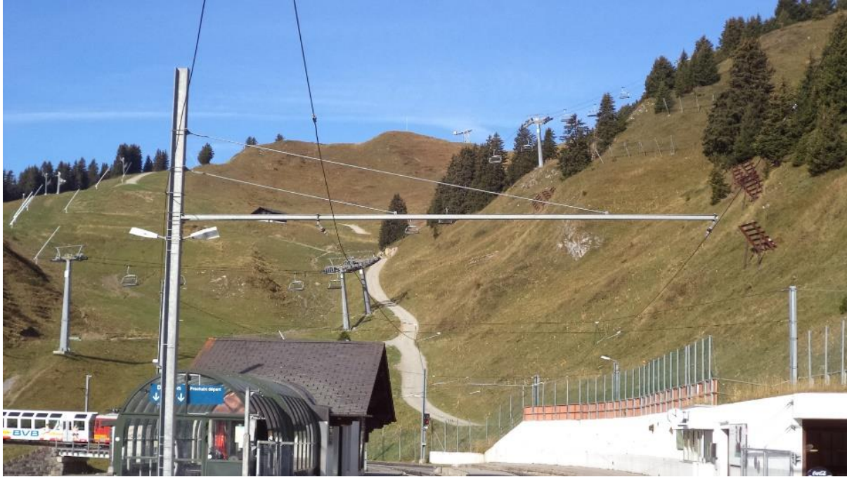
Train station at Col de Bretaye and the road leading up to VD-020.