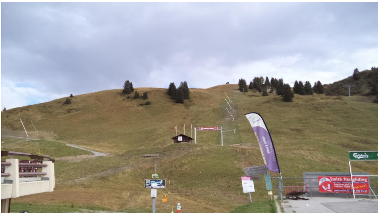
On the left side is the road leading up to VD-024, which is behind this hill.

We returned to the train station and then went on our way to VD-024 Chaux Ronde. As you can see on the map, there is no official hiking trail to the summit. We followed a dirt service road to Point 1987 and then hiked up the hillside. The total hike was 2.2 km, 269 meters of elevation and it took 51 minutes. Fortunately, it late enough in the year that the cows were down from the pastures and we didn't have to deal with them or fences. Here the activation zone is quite large, but there is nothing at all you can use for mast supports except for a shrub here and there.