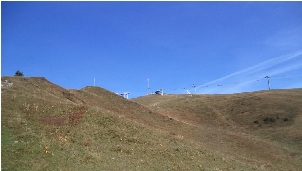
First view of VD-020 (the communications tower in the center) from the service road.