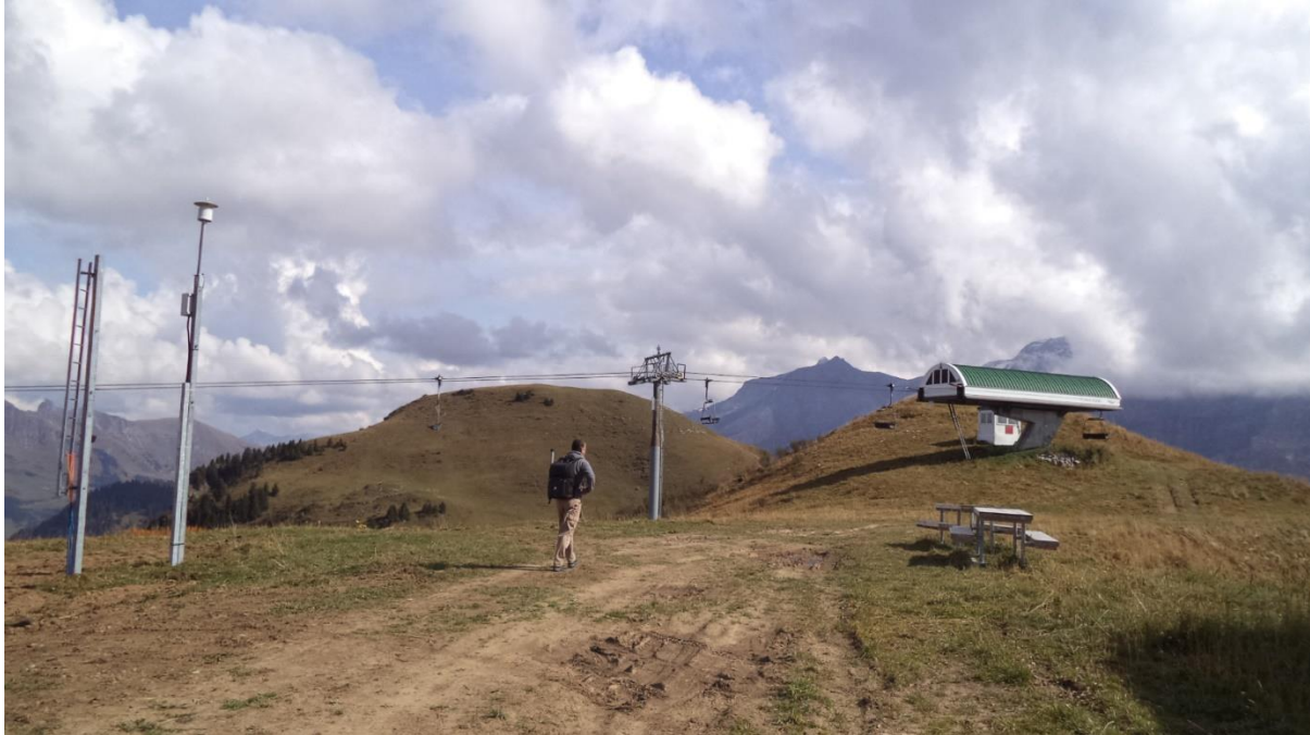
First view of VD-024, the hillside visible just to the left of the chair lift support mast.