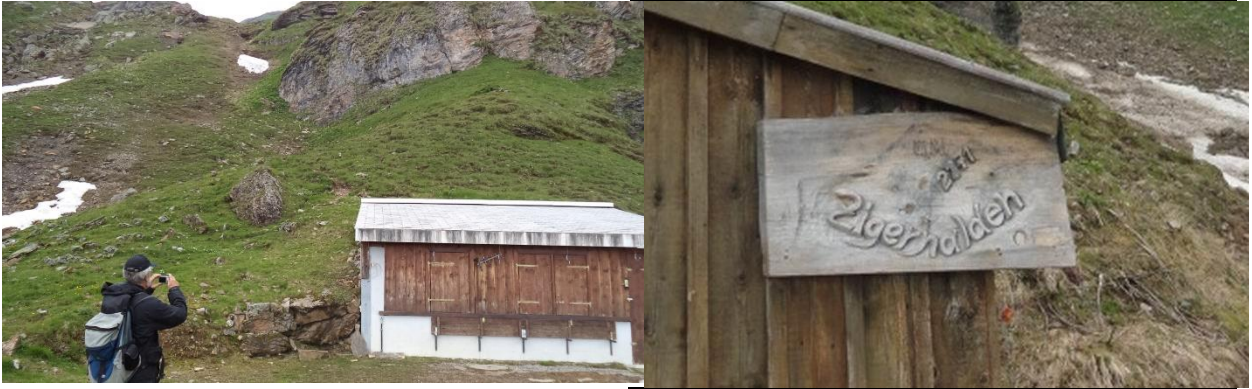
The trail for the final ascent to Hochfinsler is on the left side of this hut.