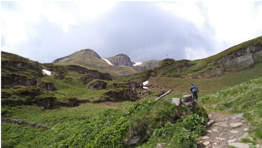
On the trail from Mädemshintersäss to the Chammhüttli (the small cross in the foreground). Hochfinsler is immediately behind the summits visible in the background of this photo.

Important note: at the bottom of the final ascent to the summit there is a mountain hut (Ziegerhalden Hut, altitude 2171 -- see the waypoint "Hut" on the map). The trail to the summit is just to the left of the hut. This trail is not marked at all, and it is not visible from the hut -- but this is the best trail going up!!