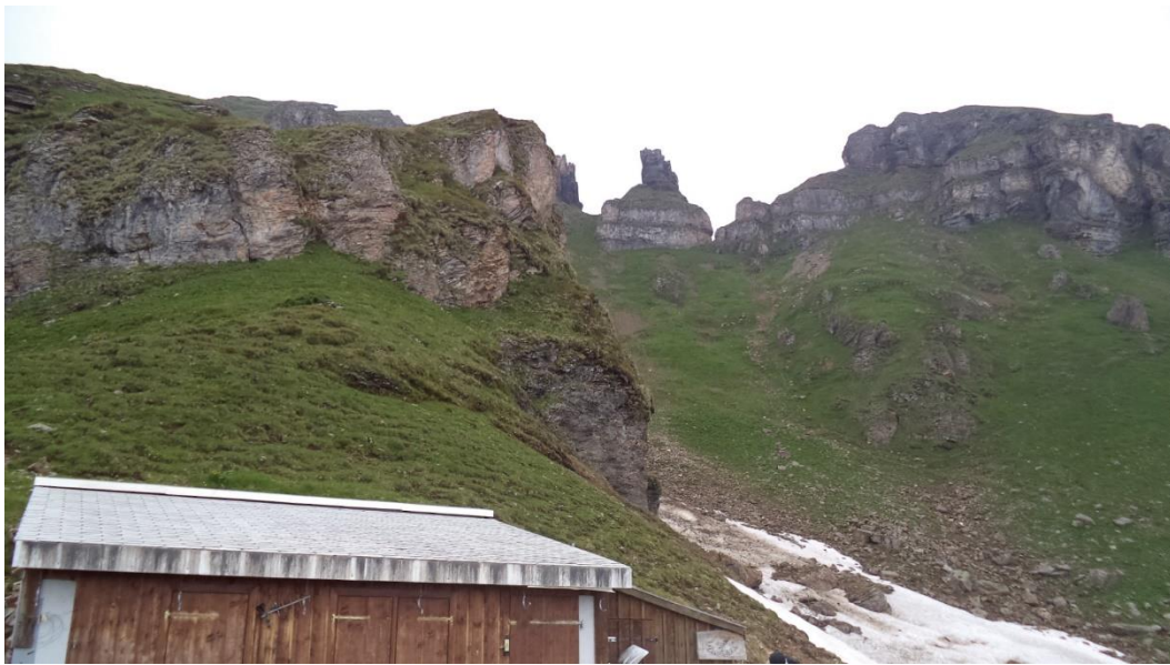
View from the Zigerhalden hut to Hochfinsler, the peak on the right of the isolated rock formation in the center of this photograph.