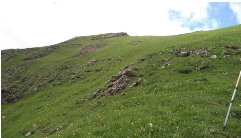
Once you get behind the rock formation in the previous photo, you take a semi-circular route to Hochfinsler (summit cross barely visible).