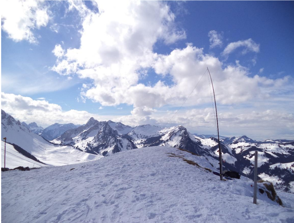
My antenna pole lashed to one of the cow wire poles at the summit.

The whole trip up and while operating I saw only one person on the summit, also on snowshoes. This day there was plenty of sun and occasional wind, but actually quite comfortable with the strong sun.