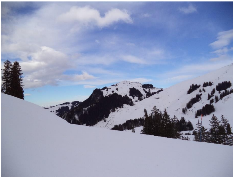
Looking at FR-027 Hohmattli from the chair lift summit station. Before you can start the ascent, though, you must go down 60 meters into the valley and then start back up.