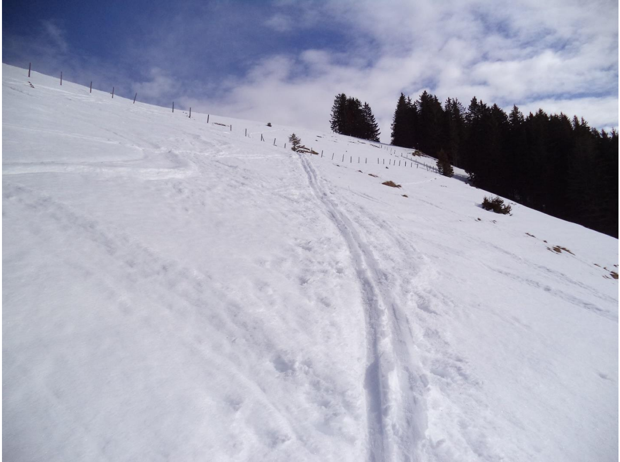
Following the zig-zag ski tracks up the hill leading to the summit.

I finally made it to the summit in 2.5 hours and was pretty exhausted (true, I'm not in the greatest shape at the moment). And although the absolute difference in altitude from the chair lift to the summit is 366 meters, I actually climbed 466 meters -- and it felt like a lot more, because all the work is in the second half. There are no exposed spots at all, so this is a T2 from a technical standpoint (T3 with caution if there is lots of fresh snow).