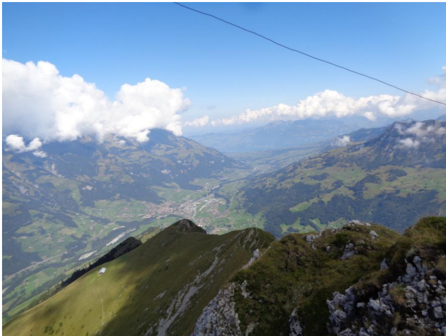
View looking north towards Lake Thun. The valley on the left is the Entschligetal leading to Adelboden, the valley on the right is the Kandertal leading, of course, to Kandersteg.

Although the hike up is not very spectacular, the views on the summit are. Note: This summit is also very suitable for snowshoe activations in winter.