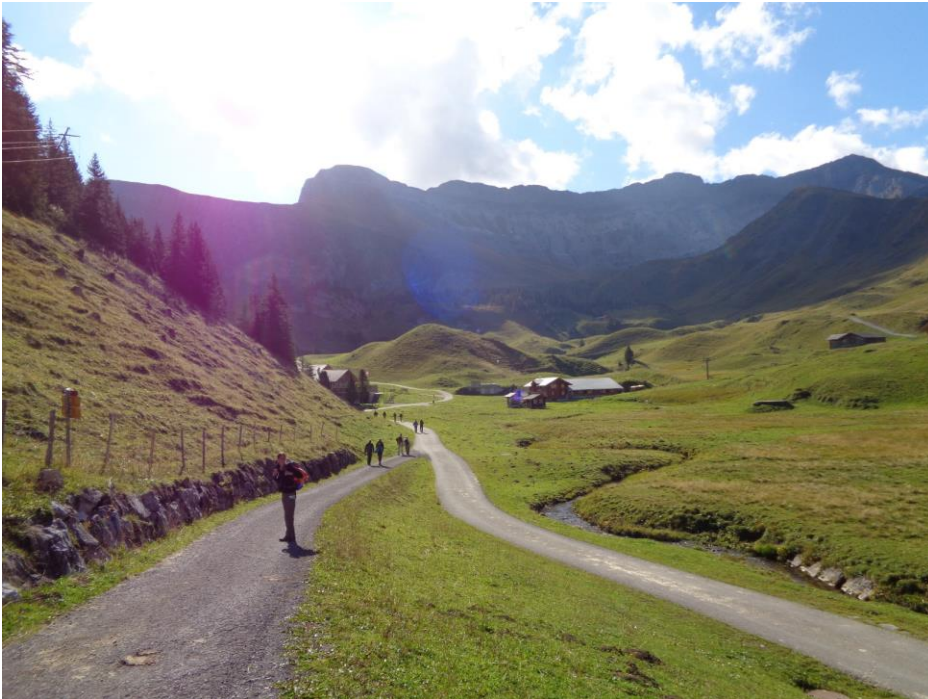
View when you get off the gondola at the summit station. On the left is a nice restaurant for a start-up coffee before the activation or a beer afterwards.

This hike starts at the Elsigbach gondola station, which has limited parking. Note for those taking public transportation: From the train station at Frutigen, you take two buses. The second of these (actually a mini-bus) has a very limited schedule and must be reserved in advance. I didn't know this, but because it was such a nice day there were other people making the same trip who did reserve the bus. The fare for this shuttle is CHF 10.00 round trip.