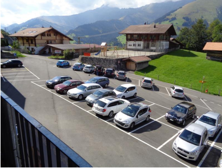
Parking lot at the gondola base station.

This hike starts at the Elsigbach gondola station, which has limited parking. Note for those taking public transportation: From the train station at Frutigen, you take two buses. The second of these (actually a mini-bus) has a very limited schedule and must be reserved in advance. I didn't know this, but because it was such a nice day there were other people making the same trip who did reserve the bus. The fare for this shuttle is CHF 10.00 round trip.