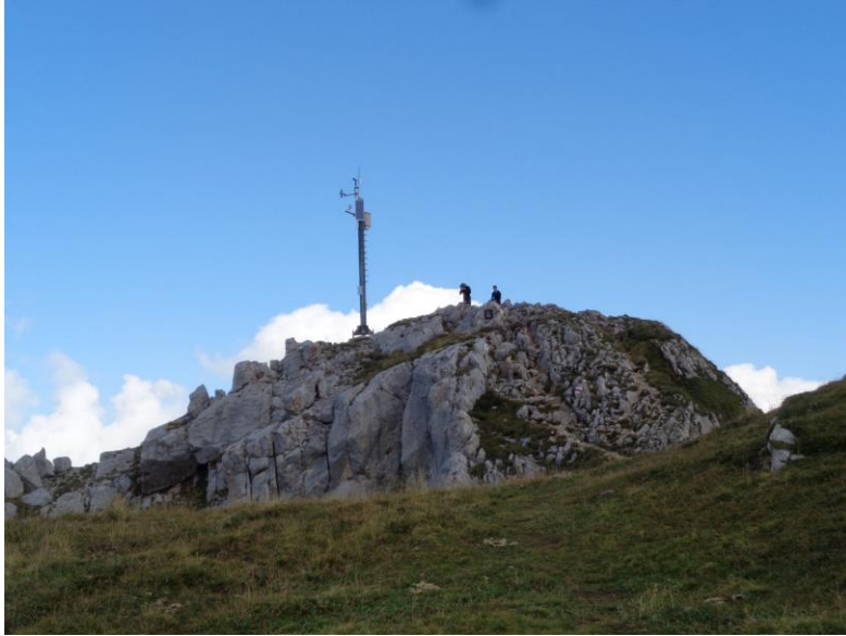
The actual summit, including the instrument tower to which I lashed my mast. There are no other convenient supports on the summit (no summit cross).

The entire 3.6 km hike up involved an ascent of 550 meters and took 90 minutes. It was all T2. In fact, on the summit (relatively crowded even on a weekday, partly because of the beautiful weather that day and partly because it is so relatively easy) I encountered my first blind mountain hiker. For antenna supports there is no summit cross but instead an instrument tower to which I attached my mast.